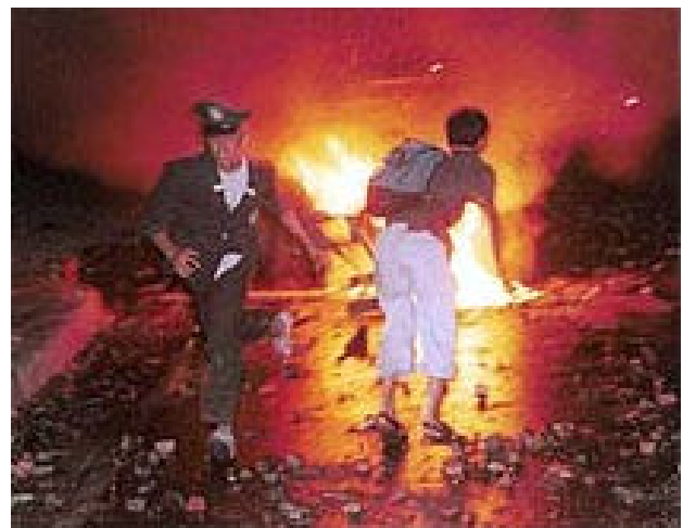
Violence in the wake of the election

determined Indonesian military. Finally in 1999, when a referendum on independence was held under UN auspices, the world paid attention. Despite widespread intimidation and violence, almost all East Timorese showed the courage to vote and overwhelmingly chose independence from Indonesia. As promised in the event of such an outcome, Indonesian controlled militia razed towns, villages and churches, while brutalizing the population and forcibly relocating some 250,000 Timorese to Indonesian controlled West Timor. The CAVR report, entitled Chega! (Enough!) , concludes that there is credible and extensive evidence that planning for and knowledge of this scorched earth campaign extended to the highest echelons of the Indonesian military.