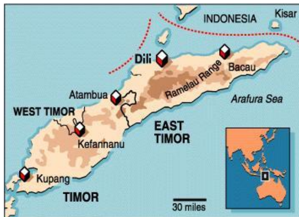
East Timor map

East Timor's 924,000 citizens are finding that the truth does not set them free and that justice and reconciliation are elusive. A recent report published by East Timor's Commission of Reception, Truth and Reconciliation (CAVR is the commonly used Portuguese acronym), estimates that the tiny island nation suffered a minimum of 102,800 conflict-related deaths during Indonesia's brutal occupation between 1975 and 1999. Responsibility for this carnage is laid largely with the Indonesian military. But the report offers a telling critique of many others including the United States, Britain, France, Australia, the United Nations and the Vatican.