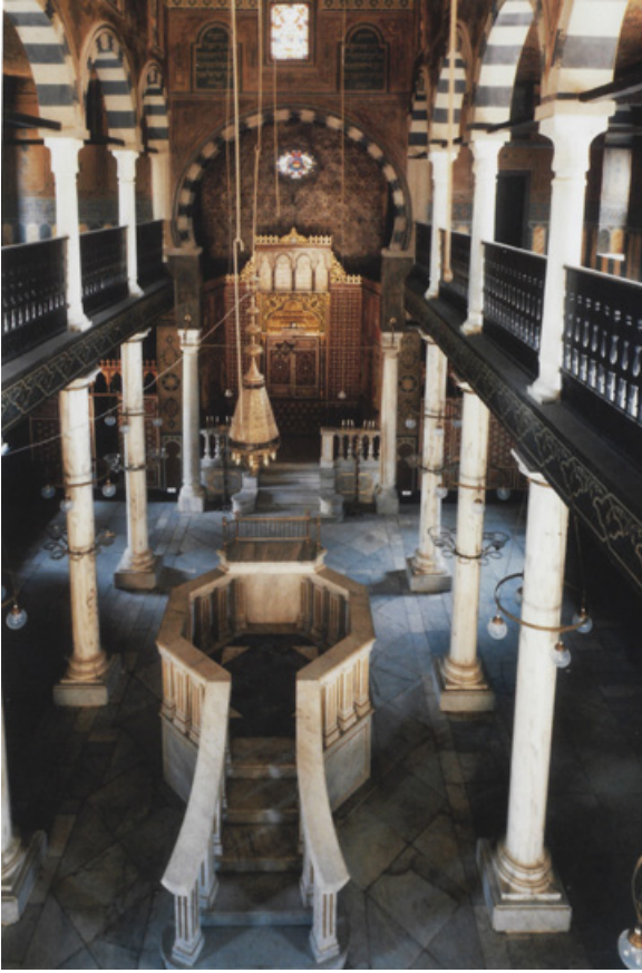
1.13. View of the interior from the upper gallery, Ben Ezra Synagogue, Cairo, Egypt.