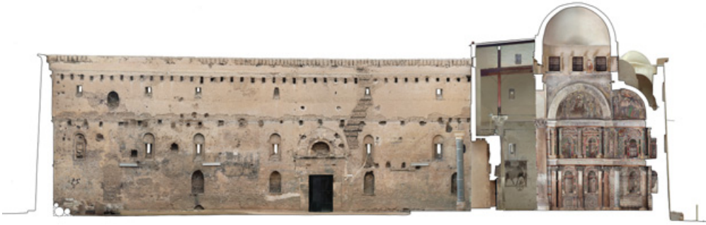
1.10. Red Monastery Church, section looking north, c. late fifth century. Laser scan drawing by Pietro Gasparri.