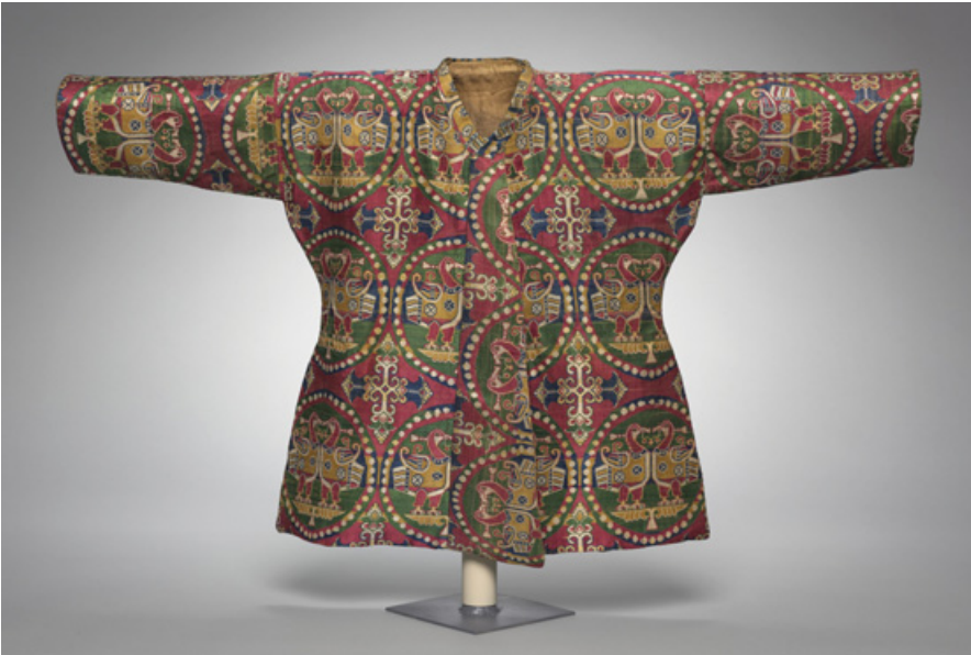
1.7. A child's coat with ducks in pearl medallions and a child's pants, eighth century CE. Iran or Central Asia, Sogdiana. Silk: weft-faced compound twill, samit. Cleveland Museum of Art, Purchase from the J. H. Wade Fund 1996.2.

The phrase Byzantine Near East may, at first blush, suggest that its terminology is accepted and stable, but this is far from the truth. That said, the label “Near East” is somewhat easier to manage than “Byzantine,” so we can begin there. Traditionally, Near East has been associated with pre-Hellenistic history in Mesopotamia and the eastern Mediterranean (i.e. pre-Alexander the Great, d. 323 BCE). Areas often enclosed by this label include the Levant, Iraq, Iran, Asia Minor, and Egypt. 12 The region covered is necessarily broad and ill-defined; in the words of an authoritative textbook on the ancient Near East, “It is important to be aware that the Near East has never been a neatly definable, coherent entity, but rather represents a series of overlapping economic, political, and cultural systems.” 13 In later periods this label includes the Caucasus, particularly for the Persian connections in Armenia and Georgia, as well as Central Asia to some degree (Fig. 1.7). In this book we have extended the inquiry south, to Nubia (Makuria), Ethiopia, Arabia, and the Red Sea littoral more generally. The benefit of the term Near East, even though it has its own baggage, is that it avoids the connotations of the term “Middle East,”