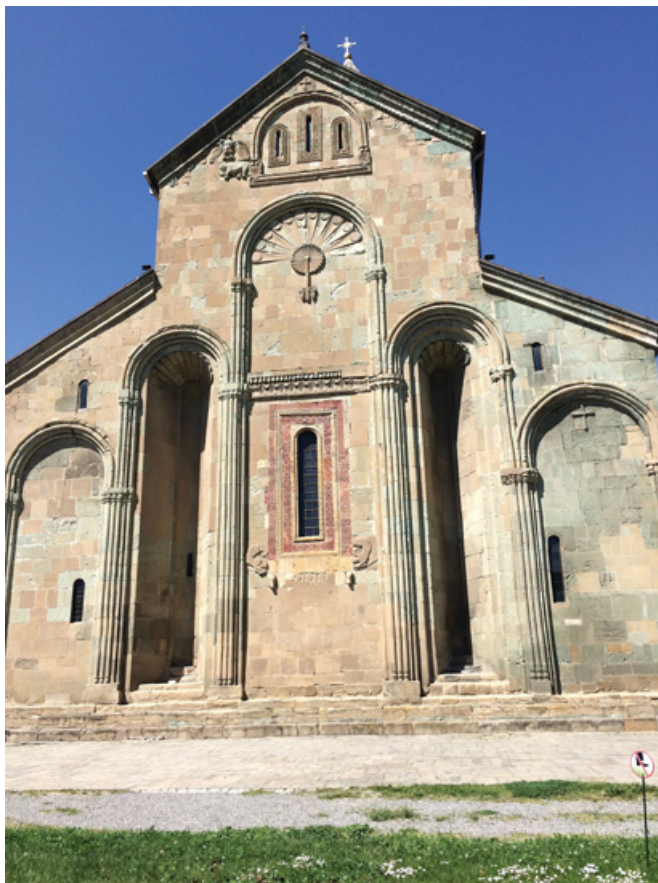
1.15. East facade, Svetitskhoveli Cathedral, Mtskheta, Georgia, eleventh century.

more firmly to its Near Eastern context. At the same time, the imprint of the Roman Empire on the Near East, even in memory, is indelible. Byzantine authority was linked to emperor and patriarch throughout, and we lose something if we ignore the role played by the Byzantine Empire and the Orthodox Church in Europe and the Near East alike. 59 That said, the notion of “Byzantium,” in its fullest sense, is a moving target. The Roman legacy is only one part of its role in shaping the Near East, both Christian and not. Highly diverse topics – yeshivot , Egyptian monasteries, liturgical objects, Jerusalem liturgy, Islamic origins – all fall under the purview of Byzantine Studies precisely because they depend, in part, on Byzantine categories for their existence and preservation and, crucially, for their study today.