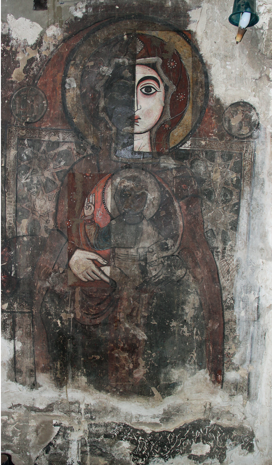
1.1. Theotokos during conservation, sanctuary, White Monastery Church. Secco painting, c. early fourteenth century.