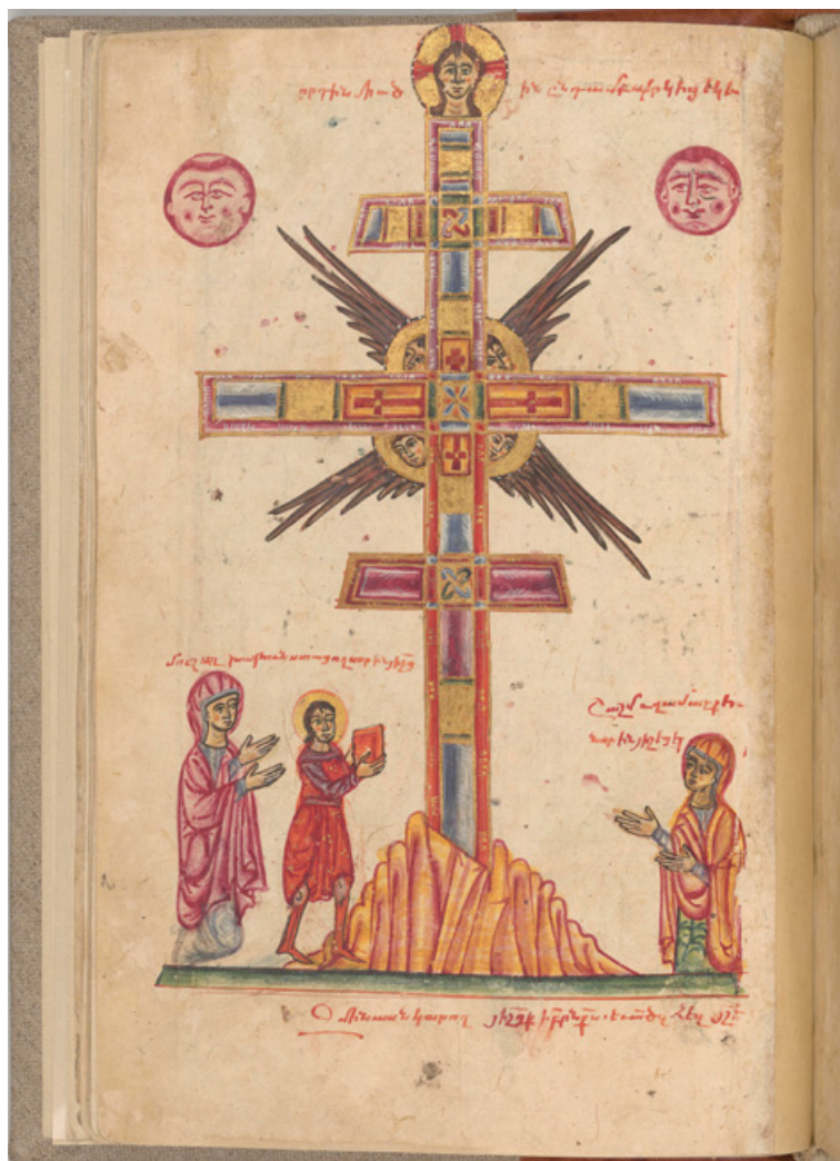
1.2. Embellished cross with donors, MS. M749, fol. 9 v. Gospel book; written and illuminated in Van, Armenia, in 1461.

these regions in the late antique or medieval period that does not take into account their presence and importance is incomplete and inadequate. In turn, and partly due to this rediscovery, Eastern Christian Studies – especially in the languages of Syriac, Coptic, Armenian (Fig. 1.2), and (Christian) Arabic – has experienced a renaissance and is entering something of a golden age, akin to the great flourishing it experienced in the late nineteenth and early twentieth centuries.