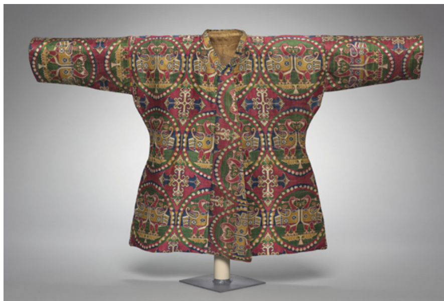
1.7. A child's coat with ducks in pearl medallions and a child's pants, eighth century CE. Iran or Central Asia, Sogdiana. Silk: weft-faced compound twill, samit. Cleveland Museum of Art, Purchase from the J. H. Wade Fund 1996.2.

The phrase Byzantine Near East may, at first blush, suggest that its terminology is accepted and stable, but this is far from the truth. That said, the label “Near East” is somewhat easier to manage than “Byzantine,” so we can begin there. Traditionally, Near East has been associated with pre-Hellenistic history in Mesopotamia and the eastern Mediterranean (i.e. pre-Alexander the Great, d. 323 BCE). Areas often enclosed by this label include the Levant, Iraq, Iran, Asia Minor, and Egypt. 12 The region covered is necessarily broad and ill-defined; in the words of an authoritative textbook on the ancient Near East, “It is important to be aware that the Near East has never been a neatly definable, coherent entity, but rather represents a series of overlapping economic, political, and cultural systems.” 13 In later periods this label includes the Caucasus, particularly for the Persian connections in Armenia and Georgia, as well as Central Asia to some degree (Fig. 1.7). In this book we have extended the inquiry south, to Nubia (Makuria), Ethiopia, Arabia, and the Red Sea littoral more generally. The benefit of the term Near East, even though it has its own baggage, is that it avoids the connotations of the term “Middle East,”