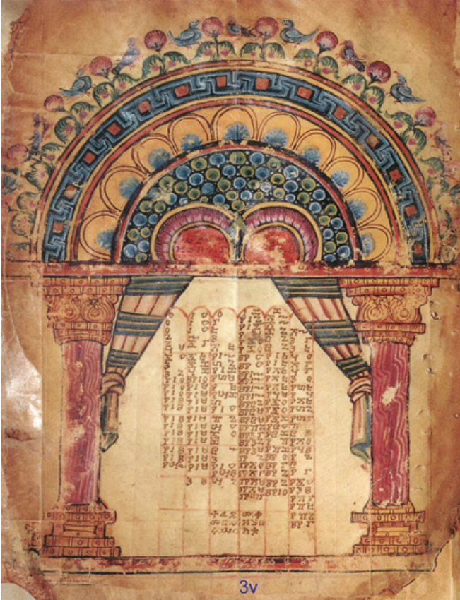
1.9. Canon Table, Garima Gospel I, 530–660 CE. Abba Garima Abbey, Tigray, Ethiopia.

address Christian communities, we see them as central to how Eastern Christians created and protected their collective identities and voices in the late Roman and early Islamic Near East. Our remit demands this breadth. In addition, like the Eastern Christians, Judaism and Islam reached a classical articulation, in some measure, in relation to a broader Byzantium. Third, and more programmatically, we focus on communication, trade, and the transmission of ideas, recognizing the lesson of global history that geography cannot alone define the study of the Byzantine Near East.