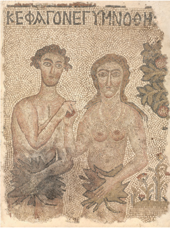
1.11. Fragment of a floor mosaic with Adam and Eve, late 400s to early 500s CE. Northern Syria. Marble and stone tesserae. Cleveland Museum of Art, John L. Severance Fund 1969.115.

and geography begs the question of what “foreign” even means in Byzantium. Objects carried cultural meaning and were markers of affiliation, yet they were often symbols of harmony and continuity as much as difference.