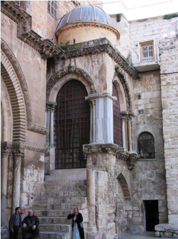
1.12. Church of the Holy Sepulcher, Jerusalem.