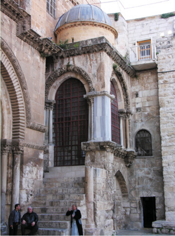
1.12. Church of the Holy Sepulcher, Jerusalem.