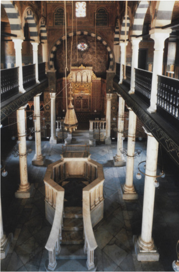
1.13. View of the interior from the upper gallery, Ben Ezra Synagogue, Cairo, Egypt.