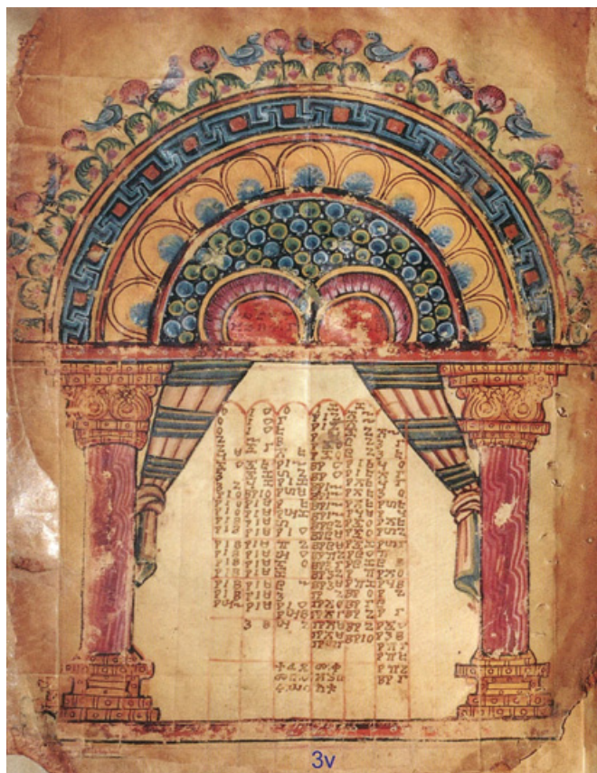
1.9. Canon Table, Garima Gospel I, 530–660 CE. Abba Garima Abbey, Tigray, Ethiopia.

address Christian communities, we see them as central to how Eastern Christians created and protected their collective identities and voices in the late Roman and early Islamic Near East. Our remit demands this breadth. In addition, like the Eastern Christians, Judaism and Islam reached a classical articulation, in some measure, in relation to a broader Byzantium. Third, and more programmatically, we focus on communication, trade, and the transmission of ideas, recognizing the lesson of global history that geography cannot alone define the study of the Byzantine Near East.