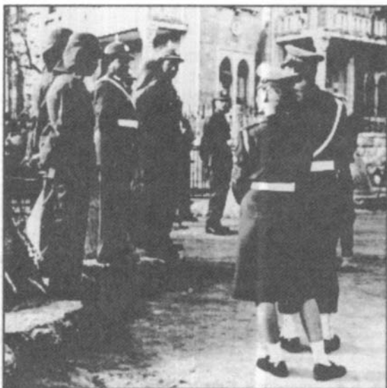
From City of Stone