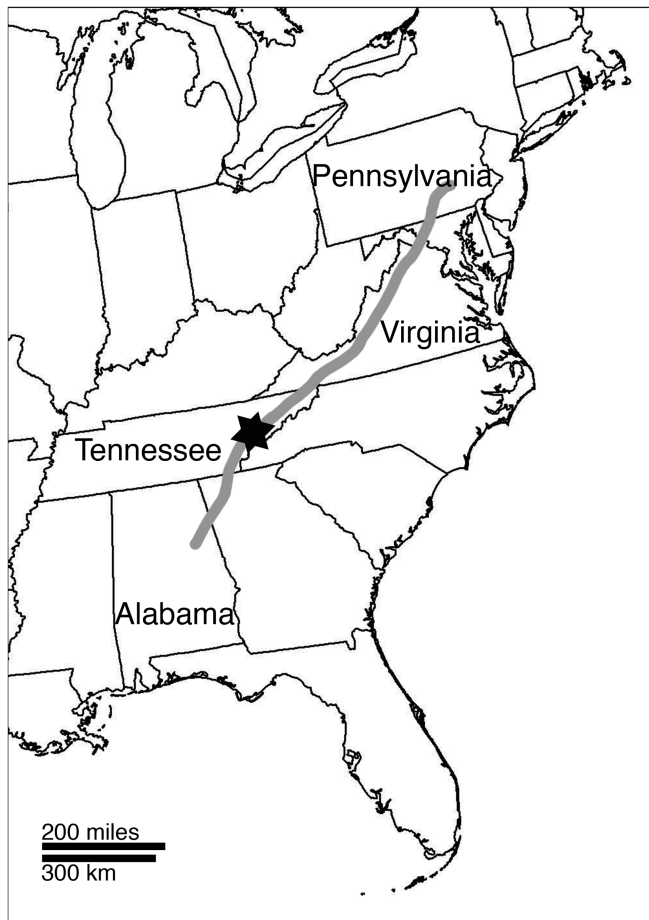
Figure 1. Map of eastern U.S.A. showing trend of Ediacaran to lower Cambrian Chilhowee Group (gray shading) in southern and central Appalachians. Star symbol indicates location of Chilhowee Mountain, Blount County, Tennessee, where the fossils discussed herein were collected.

(e.g., Walcott, 1910; stratigraphic divisions for the Cambrian of Laurentia follow Palmer, 1998). However, subsequent systematic revisions have greatly restricted the inclusivity of the genus (e.g., Palmer and Repina, 1993; Palmer and Repina in Whittington et al., 1997; Lieberman, 1998, 1999). With the recent reassignment of many species of “ Olenellus ” sensu lato to other genera, occurrences of Olenellus sensu stricto are apparently restricted to the mid- and upper Dyeran (provisional Cambrian Stage 4; Peng et al., 2012) (Webster, 2011 and references therein; Webster and Bohach, 2014). The historical records of “ Olenellus ” within the Chilhowee Group must, therefore, be re-evaluated in light of modern systematics in order to exploit their full biostratigraphic potential. Unfortunately, re-evaluation of the Murray Shale record is hampered by: (1) the absence of any description or illustration of specimens; and (2) the failure of subsequent workers to collect any additional trilobite material, despite concerted efforts. The lack of success is due in part to poor and confusing descriptions of field localities (see below) and the apparent rarity of specimens. Indeed, several workers have expressed doubt regarding the supposed stratigraphic provenance of the material reported by Walcott and Keith (see below).