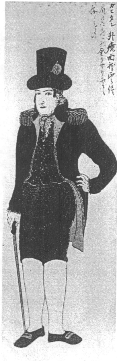
Portrait of a Dutch director of Deshima, probably Hendrik Doeff or Jan Cock Blomhoff. Wood engraving, c. 1800