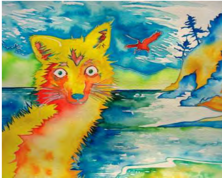
Representation of Chiri Yukie's "Fox's Song"

object (analyzer and analyzed) between Kindaichi and Chiri, was something far more unstable and volatile than is generally thought.