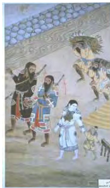
Ainu group in a Japanese representation in Edo

With respect to their old customs, the great majority of the Ainu have not yet managed to escape a savage and uncivilized stage...From the very outset, the task of opening the frontier can only be accomplished by an ethnos that has reached a certain cultural level. It is of course impossible to hope that this opening of the frontier could be performed by the people of Ezo themselves, a people that has not yet left behind a period of primitive savagery – the only ethnos among those close to Hokkaido and near to the Ezo people which possesses a culture capable of enduring this duty is unquestionably the Japanese. [2] The formulation of a cultural hierarchy seen in this passage provided the logic that enabled the Japanese state to justify the necessity for its people to appropriate and rule the territory of Hokkaido in place of the Ainu by making the former the assumed subjective motor-force of this “opening,” while rendering the latter into an ethnicity ( minzoku ) that had “not yet managed to escape a savage and uncivilized stage.” Further, the new anthology of Hokkaido history compiled in 1937 insisted on the point that the “opening” made it possible for the Japanese to “enlighten the Ainu,” who had “for a long time continued their primitive lifestyle,” through the imperial assimilationist educational policy ( kominka kyoiku ) and it brought about a real possibility for the Ainu to “be granted universal brotherhood, and treated as national citizens.” [3]