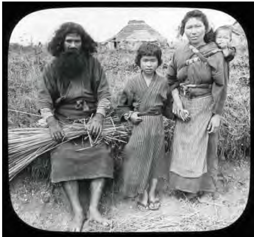
Ainu family, 1906

Seen in this way, we can understand that the discourse of “opening” operates as a universalistic expression of the ethnic enterprise and its progressiveness. A society like that of the Ainu, possessing neither the form of the nation-state nor the structure of capitalism, is thus posited as an ethnicity which utterly lacks the ability to manage itself, to say nothing of the ability to “open” frontiers. It is the “undeveloped” or “childlike” remnant left behind by the historical law of “progress,” one whose only option is to survive through the leadership and patronage of a more “progressive” ethnicity. Consequently, historicism and ethnocentrism resolve themselves in reducing the rich historical experience of mankind to the binary structure of “progress or stagnation,” and each ethnicity is thereby rewritten into a narrative of its oscillating rise and fall.