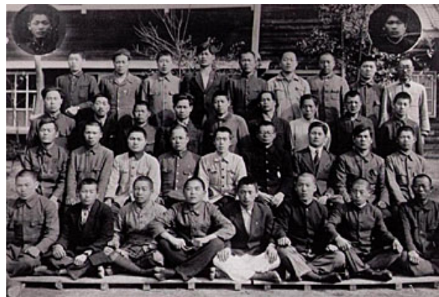
Korean forced labourers of Aso Mining Co. in front of their dorm at the Atago Mines

2008, Japan's Aso Taro and Korea's Lee Myung-bak adopted a similar stance, agreeing to bury historical problems in order to concentrate on the economy. When we recall that the company run by Aso's family during World War II had used Korean forced labour at its mines and that Aso had previously infuriated Koreans by defending wartime atrocities, Lee's setting aside of history can be interpreted as a sort of priority to economic benefit over justice and national dignity.