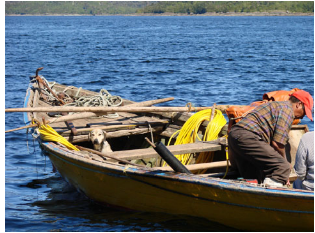
PLATE 3 Transport of dogs by artisanal fishermen.

The questionnaires indicated that fishermen sometimes hunted Magellanic penguins for bait (45%) or food (16%) and collected their eggs for consumption (39%). Kelp gulls