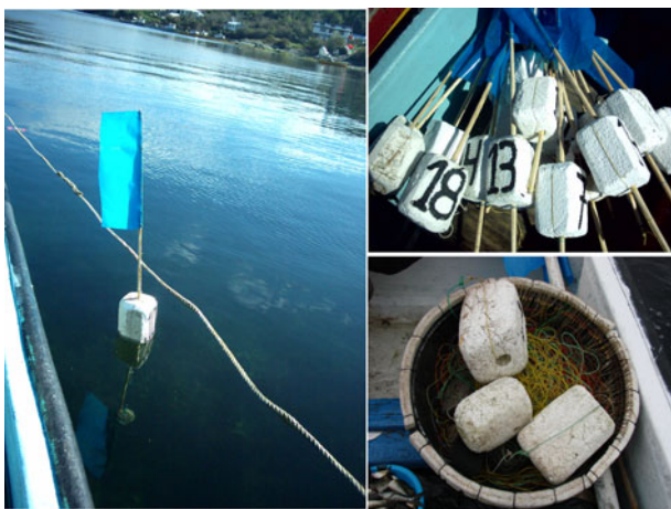
PLATE 1 Artisanal drift line known as atorrante . Left, settled line in shallow waters to show line's detail and its bottom weight. Upper right, buoy and flags. Bottom right, line and hooks.

what is considered to be a globally important breeding area for albatross species (Moreno & Robertson, 2008). Isolated fishing areas and extreme weather in this part of Patagonia encourage the creation of seasonal camps, where additional interactions between fishermen and seabirds could have detrimental effects on seabirds.