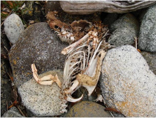
PLATE 2 Skeleton of a Magellanic penguin Spheniscus magellanicus found at a landfill associated with fishing camps. Penguins are often hunted by fishermen for food or bait.

Fishermen perceived more birds (67%), the same number (23%) or fewer birds (10%) compared to 10 years ago. Fishermen who reported more birds associated the trend with increased food abundance, decreased human predation, the absence of the invasive American mink Neovison vison , and increased food availability from salmon farming. Fishermen who perceived a decrease in the abundance of seabirds attributed the decline to dispersion to other areas with greater food availability, or to pollution, oil spills and red tides. A c. 350 m 3 oil spill along Moraleda Channel, in 2001, was responsible for seabird mortalities and other unquantified ecosystem effects.