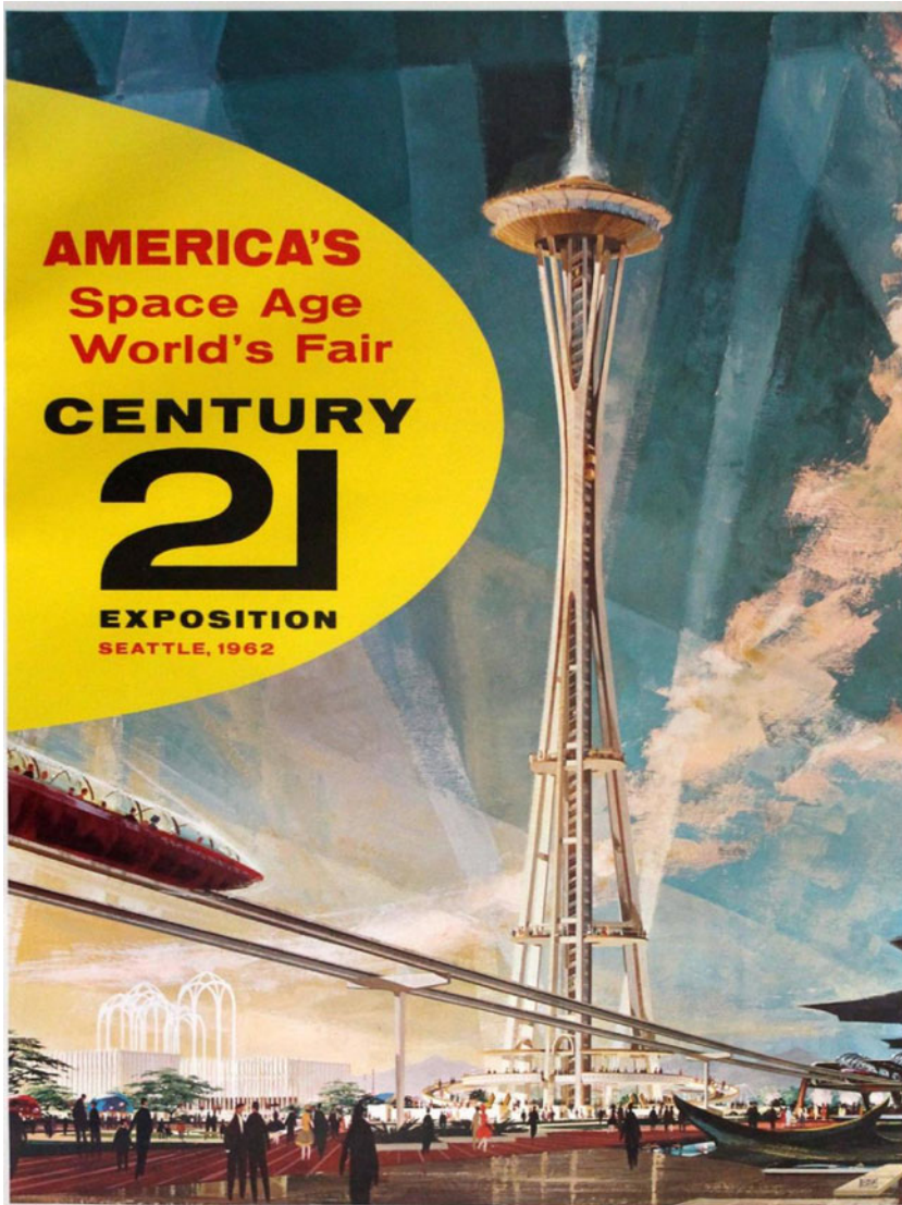
Figure 1 (Colour online) Poster for the Seattle World's Fair.

succinctly and less generously in a review of the fair, dismissing it as 'a trade fair overlaid with Coney Island'. 7