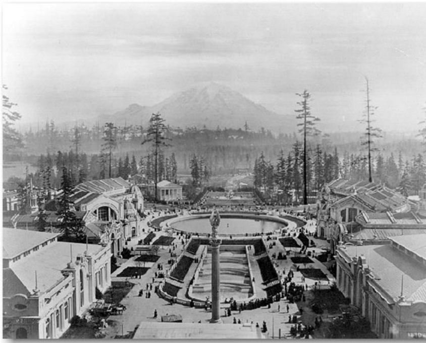
Figure 3 Rainier Vista at the Alaska-Yukon-Pacific Exposition, 1909.

The first half of the concert featured the world premieres of four previously unknown groups of compositions: Three Poems for Voice and Piano (1899–1903), Three Songs after Poems by Ferdinand Avenarius (1903–4), the String Quartet (1905), and Five Songs after Poems by Richard Dehmel (1906–8). 30 The programme began with ‘Vorfrühling’ (‘Early spring’), Webern’s earliest extant song. Composed in 1899, when Webern was fifteen, ‘Vorfrühling’ predates Im Sommerwind by about five years. It opens with a perfect fifth in the left hand of the piano, utilizing a device common to much eighteenth- and nineteenth-century pastoral music in which ‘the “root” of the tonal system itself . . . acts as a symbol for a primal stage of nature’. 31 The same fifth returns towards the end of the song, which closes with a repetition of the opening four bars. The ascending vocal line on the words ‘ Leise tritt auf ’ (‘Tread lightly’) is marked so zart als möglich (‘as gently as possible’), as the soprano ascends to a high Eb and the fifth fades away below. Harold Schonberg reported that ‘Vorfrühling’ and the other early songs heard on the programme were ‘in the idiom of