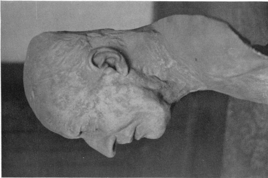
Figure 5. Two views of the death-mask bust of Samuel Johnson that was originally owned by his surgeon William Cruikshank. The deep scars from the scrofula are shown on the left, the side on which Johnson was operated. In the right-hand picture scars are seen along the mandible on the right side of the neck.