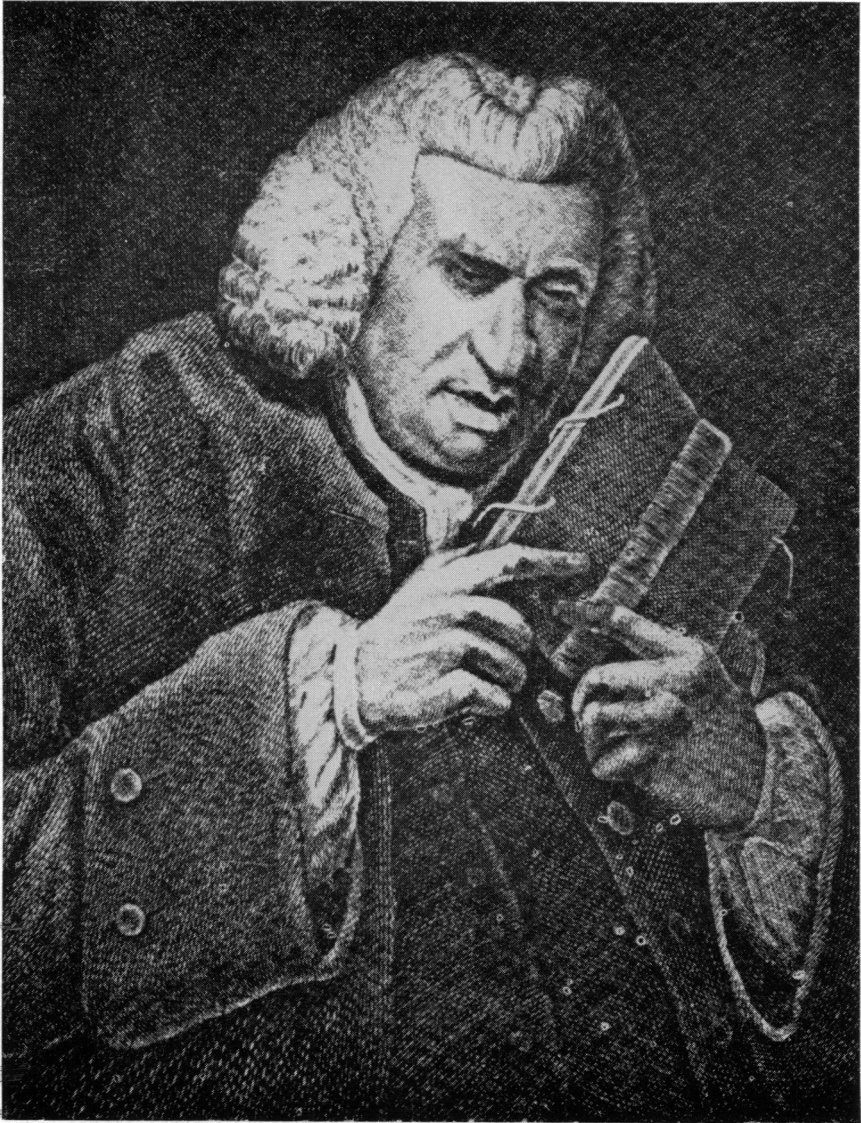
Figure 2. From an engraving by De Clausen 1813 after a portrait by James Northcote, R.A., showing Johnson squinting, 'holding a book close to his face at an awkward angle. His figure is ungainly and the whole picture is not pleasing.' 5