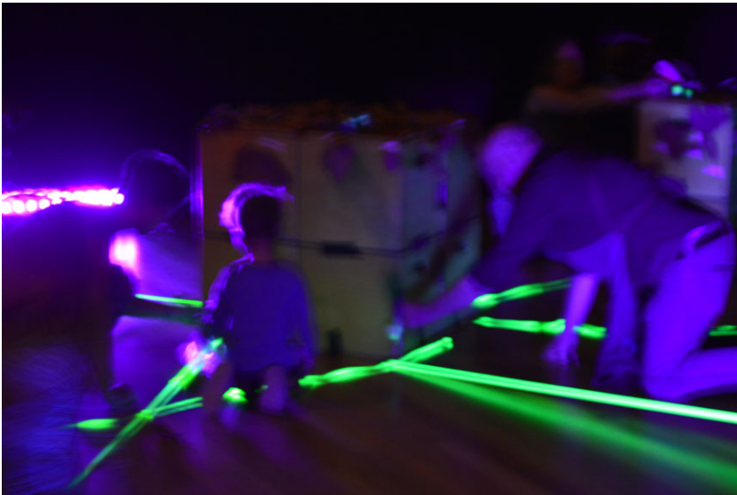
Figure 3. Experimental activity during the “making” phase of Wood Wide Web.

multiple ways and incorporated dramatic, visual and architectural strategies of various kinds. As children enter the immersive environment they take on the role of fungal messengers, and soon learn that the trees really do speak to them, ask their names and share energy balls packed with nutrients to redistribute to other trees in need. The “voice” of each tree emits from a cone shaped hollow, which unbeknownst to the young children, connects to a tube that runs up to a balcony where actors voice the characters of the trees in real time. This can be considered an example of