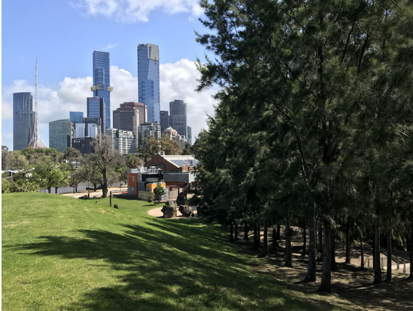
Figure 1. Photograph of Birrarung Marr showing the Victorian era tram station now housing ArtPlay (centre) and the grove of she-oak trees (right).

their sacred birthing trees to make way for a highway not far from our research site at Birrarung Marr (Kirkham, 2023).