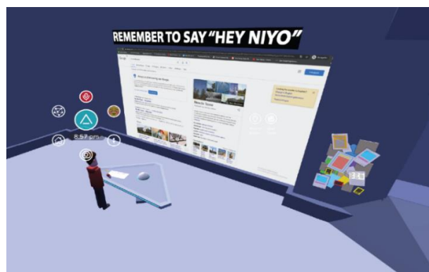
Figure 2. B-Set, session 9: The participant is performing a web research to solve a clue while interacting with the AIA in the custom-built escape room environment.