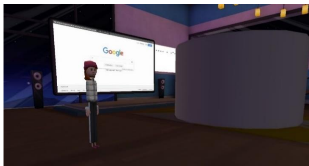
Figure 1. A-Set, session 3: Created using a template SVR environment. The AIA manifestation is an out-of-scale cylinder in the middle of the room.

Upon completion of the escape-room, we carried out 5-15 minute semi-structured interview with each participant. Ultimately, we used participant validation, through member checks (Ravitch & Mittenfeller N, 2015), to have the participants reflect on their experience and perception of the AIA's fidelity level and to verify the level of immersion of the iVP.