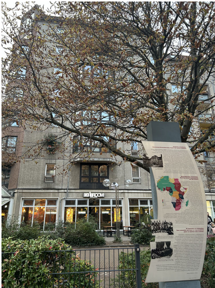
“Kongokonferenz”, Wilhelmstraße 92, Berlin-Mitte, 12 October 2024