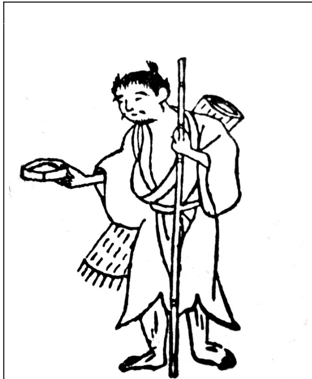
Edo Period Hinin Beggar, from Illustrated Sino-Japanese Encyclopedia (Wakan sansai zue, 1712).

hardships due to frequent rain storms” the previous year. 6 In En’pō 8 (1680), the shogunate issued a directive that sake brewing be reduced to half that of the previous year and sake not be sold until the second month of the following year. 7 A directive the following year ordered that sake brewing in all provinces be reduced to half of the previous year until the following fall. 8