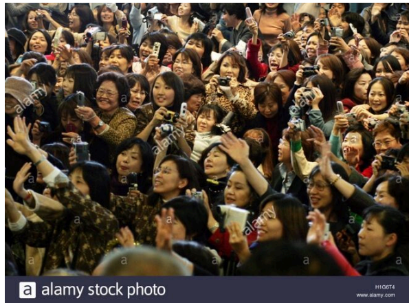
Japanese female fans greet Bae Yong-joon

comics. It may even have been one element motivating the notorious Zaitokukai, the quasi-fascist hate-group targeting zainichi and other foreigner residents in Japan. When life seems a bit complicated and full of people different than you, blame it on Yon-sama.