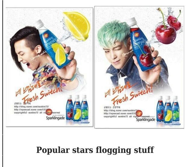
Popular stars flogging stuff

It is striking that online and published CV's of South Korea's successful actors list, right after films appearances and TV drama roles, the best-known ads in which they have featured. That direct commercial connection is something generally played down, or passed off with irony, in the case of most American and European actors. (Of course, in the UK one short-hand term for people in advertising is 'creatives' - not a claim that goes unchallenged.)