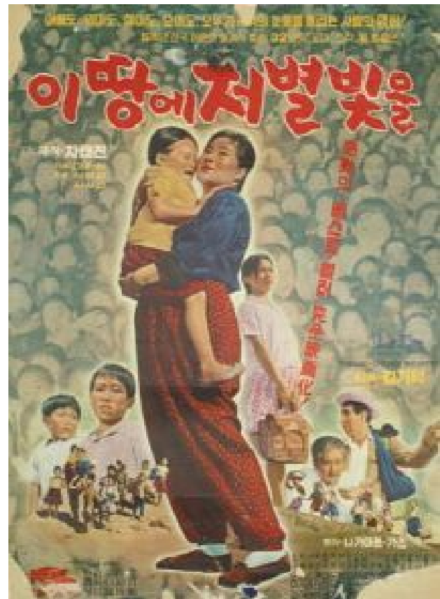
The Same Starlight on This Land, 1965

The Normalization Treaty and the mini-Hallyu of the past