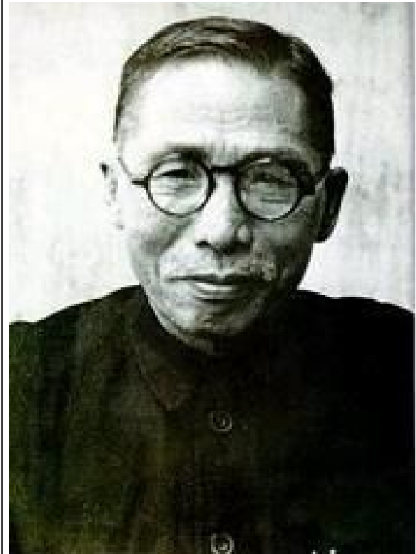
Kim Ku, 1876-1949

Kim Ku (1876-1949), in this rightly famous call to culture published not too long before his violent death, went on to articulate a vision of a Korea in which Koreans would not only be free for the first time in a long while to be Korean, but would as well project their culture out into the world. As he put it: ‘I wish our country to be not one that imitates others, but rather the source, goal, and model of this new and advanced culture. And in that manner, I wish our country to both initiate and embody true world peace. . . . In addition, the historical timing of all this at a time when we are