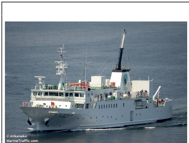
The Etopirika, which is used for visa-free visits to and from the Southern Kurils/Northern Territories.

the former residents and their relatives to visit the islands. The existing system, which has operated since 1992, enables relevant Japanese citizens to visit the islands without the need of a visa, which would acknowledge Russian authority. To make the system reciprocal, Russians now living on the islands are permitted to visit Japan under the same conditions. These annual summer visits are conducted using the Etopirika, a Japanese passenger ship that is based at Nemuro, the closest Hokkaidō port to the disputed islands. These trips can be very time-consuming, not least because it has been the practice for all entry procedures to be conducted at sea at a point near Kunashir/i. This means that, even when traveling to one of the other islands, all visitors must go by way of Kunashir/i, in some cases adding six hours to the journey time (TASS 2017). Additionally, even during the summer months, the weather conditions and visibility in the area can often be poor. These factors mean that it is increasingly difficult for former residents, whose average age is over 80, to make the trip.