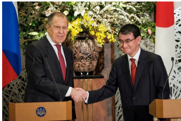
Foreign Minister Kōno Tarō hosts Russian counterpart Sergei Lavrov in Tokyo on 21 March 2018.

and signed a cooperation agreement between the LDP and United Russia Party ( Mainichi 2018b; RIA Novosti 2018). At the same time, Sekō Hiroshige, who is Minister of Economy, Trade and Industry, as well as Minister for Economic Cooperation with Russia, was in Moscow to meet First Deputy Prime Minister Igor Shuvalov. The purpose of these talks was to ensure that meaningful economic agreements would be ready for announcement at the St Petersburg International Economic Forum on 25 May.