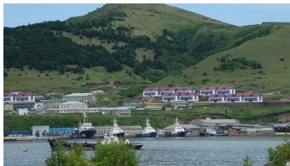
Island of Shikotan, where Russia has established a special economic zone.

Russia has therefore shown little inclination to compromise on the most important legal question. Instead, Russian politicians have sought to encourage Japan to invest under Russian law, warning that, if Japan does not proceed quickly, Russia will solicit investment from other countries (Podobedova 2018). This threat appeared to be carried out when, in March 2018, Sakhalin Governor Kozhemyako announced that an unnamed U.S. firm had agreed to invest in a diesel power plant on the island of Shikotan (News24.jp 2018). The Russian side also appears eager to press forward with the details of the joint economic projects, thereby making it harder for the Japanese side to walk away if their legal demands are not met.