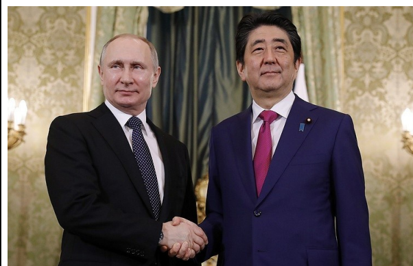
A breakthrough remains unlikely when