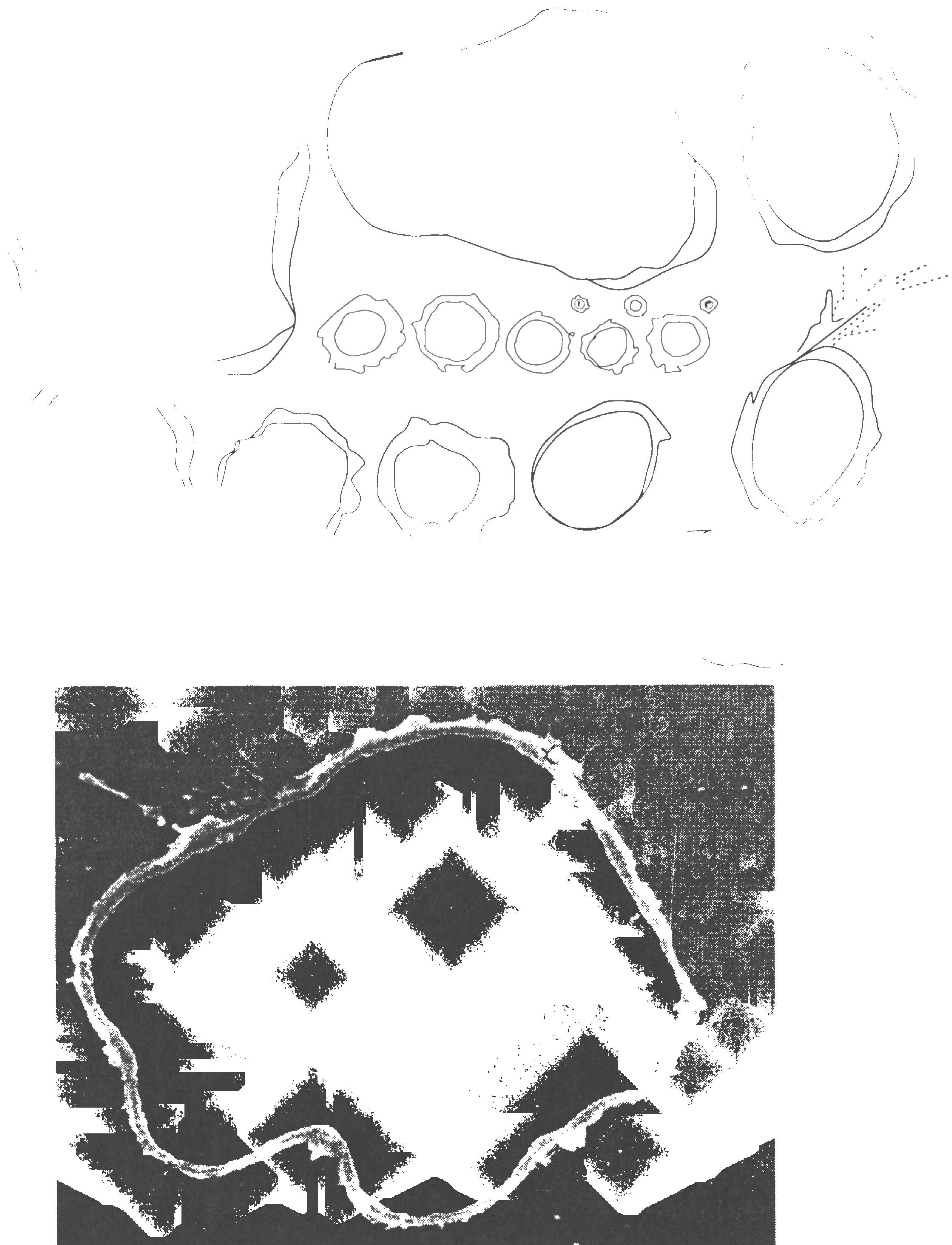
Figure 3. Typical perforations found on the EuReCa TiCCE experiment. Particle shape is not preserved for the smallest impacts, but large particles effectively “punch out” their geometrical cross section. The line drawings in the upper portion of the figure are all at the same (arbitrary) scale. It should be noted that some of the ellipticity in the foil perforations is due to non-normal impact trajectories.