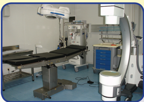
Inside OT in KATIKO Referral Hospital