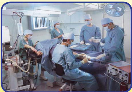
NorBase single and expandable containers