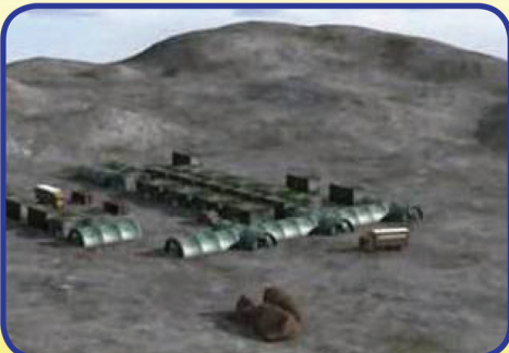
Norlense inflatable tents