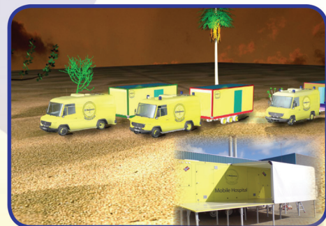
All kinds of Mobile Clinics