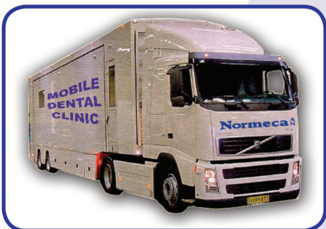
All kinds of clinics or hospitals in MultiSpace