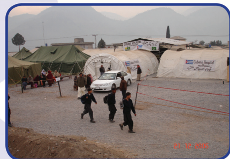
Cuban Hospital, Muzaffarabad, Pakistan