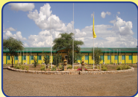
KATIKO Referral Hospital, Southern Sudan