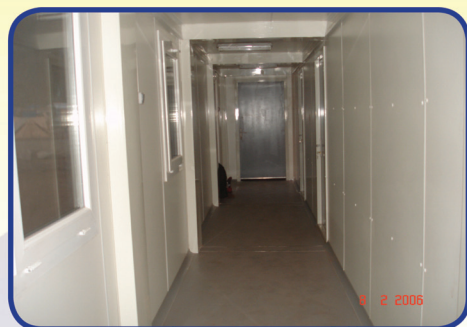
Inside MSF Hospital in Hattian Bala

Number One in the world within partly and turn key solutions incl. Transportation, Erection, Management, Training, Maintenance, Education, Administration, Storage, Out sourcing, Medivac, etc.