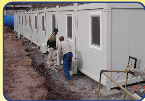
MSF Hospital, Hattian Bala, Pakistan