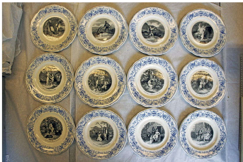
Figure 4.4 Anon., set of twelve plates with scenes from Paul et Virginie (1849–1867). Manufactured by Creil et Montereau (Oise, Seine-et-Marne). Number 1 is in the lower-right-hand corner of the bottom row; number 12 is in the far left of the top row. 128