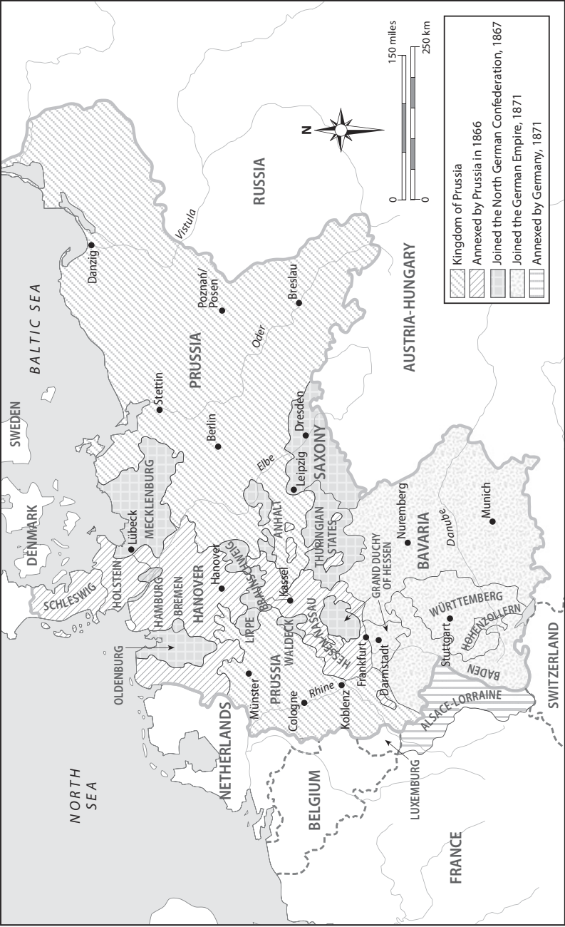
Map 3 The German Empire, 1871–1918.