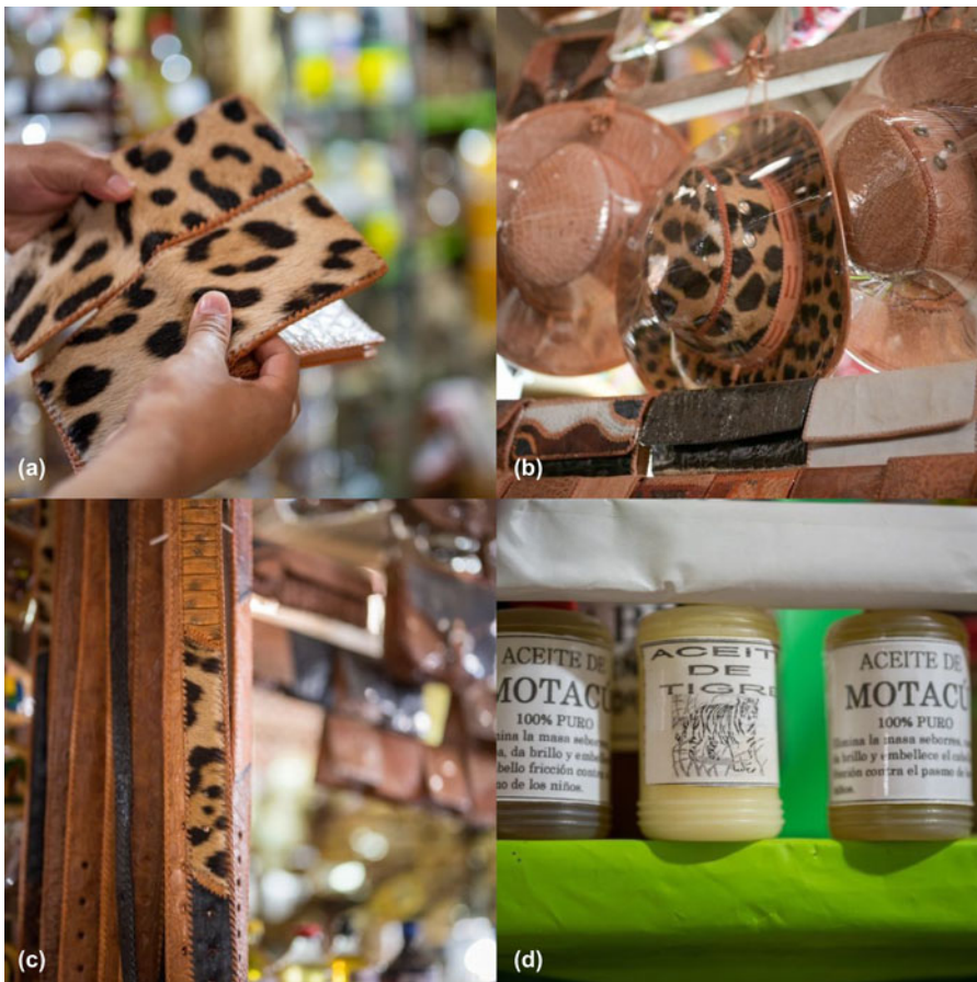
PLATE 1 Products made from jaguars Panthera onca and other wildlife on sale at a market in Trinidad, north-western Bolivia: (a) wallets made from jaguar and caiman (Caimaninae) skin, (b) hats made from jaguar and caiman skin, (c) belts made from jaguar and caiman skin, (d) ‘tigre’ oil (note that the word ‘tigre’ is commonly used to refer to P. onca in Bolivia).

An interview with a vendor of jaguar skins at El Campesino market in Trinidad indicated that the San Borja municipality in Beni was the primary location where jaguars are being targeted to supply the illegal production of wildlife products in Mocovi prison (Anon., pers. comm., September 2022). However, contrary to previous anecdotal reports, the footage provided showed no evidence of inmates being coerced into this illegal activity; instead, an inmate stated that they did so willingly to ‘earn a living for daily sustenance’ (Anon., pers. comm., September 2022). It was impossible to determine the full scope and scale of the production of illegal wildlife products at Mocovi prison from the footage provided; however, one inmate stated that they could produce up to two dozen items over the course of 3–4 days (Anon., pers. comm., September 2022). In addition, although no information on the intended destination of the wildlife products was provided, the inmate shown in the footage stated that large bulk orders had been received from a non-Bolivian client base (Anon., pers. comm., September 2022). This corroborates findings from previous studies that have described a diverse foreign market for