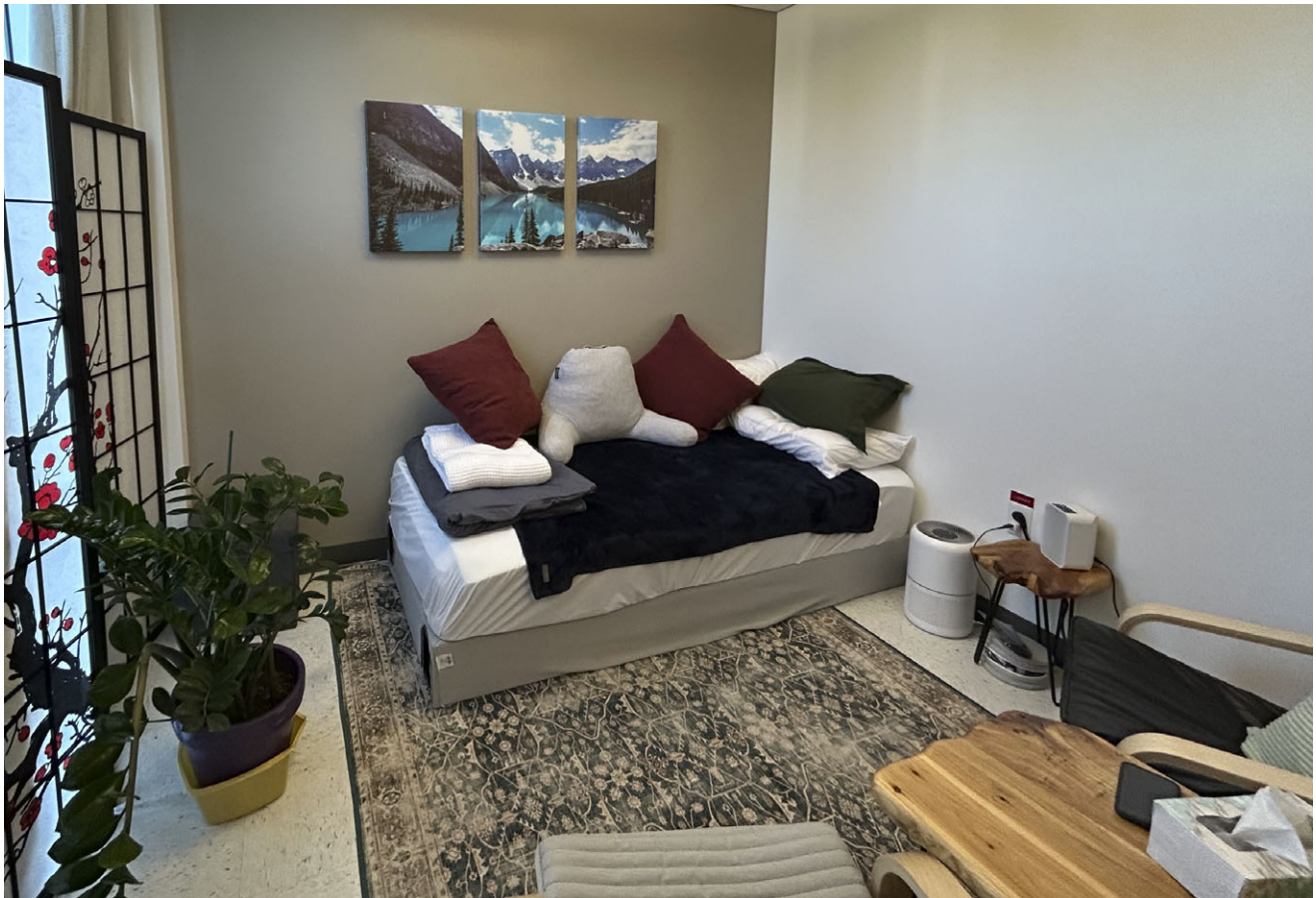
Figure 2. Design of the therapy room used for psychedelic studies at the Exploratory Therapeutics Laboratory, Stanford University.

from published treatment manuals 61,81–83 and reviews on the subject. 25,87–90