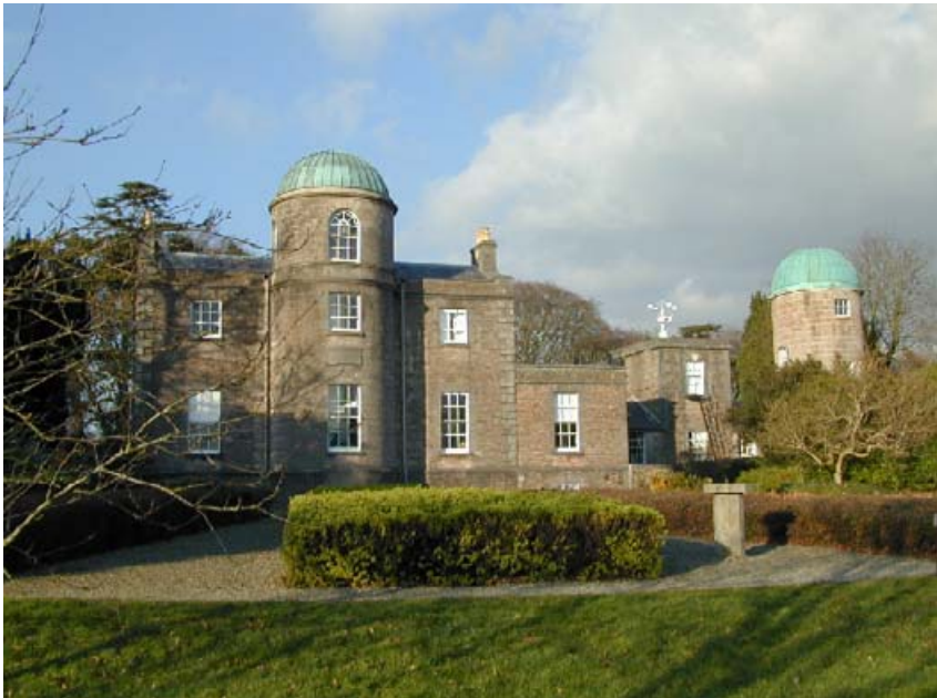
Figure 9. Armagh Observatory, founded in 1790 by Archbishop Richard Robinson.