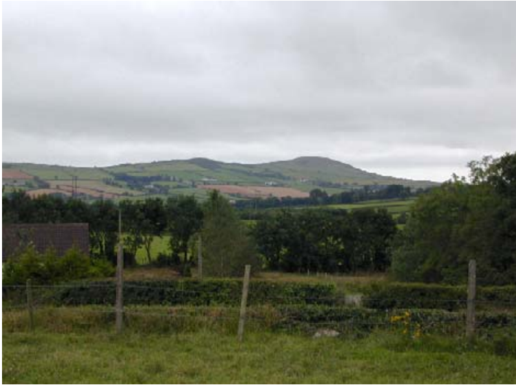
Figure 5. The view from the townland of Cavan, Co Donegal, towards the southern horizon.