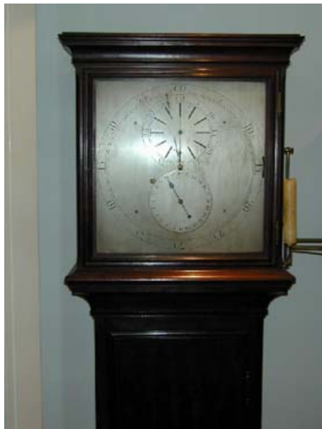
Figure 4. An Astronomical Regulator by Shelton from the Kew Observatory, made for the Transit of Venus, 1769.

Though conditions were far from perfect, nonetheless, Mason had observed both contacts at ingress and when Maskelyne received word from him on 21 June, he was evidently very pleased. The only point of regret was that clouds and rain had prevented Mason from seeing the whole of the following solar eclipse, which, if he had observed it in its entirety, would have gone a long way to fixing his longitude. Though Mason had only been