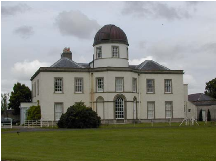
Figure 10. Dunsink Observatory, founded in 1785 by Trinity College, now a part of the Dublin Institute for Advanced Studies.