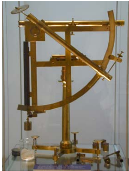
Figure 3. A Quadrant of 12 inches radius by John Bird, made in 1768 for the Royal Society's Transit of Venus Observations the following year.