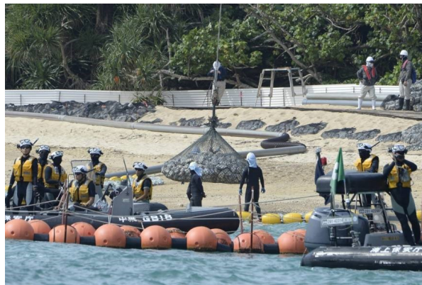
Base Construction begins at Henoko, April 2017

Creating a feeling of spreading helplessness, they set about gathering the votes of specialized sectors, with the LDP working on business and workplaces and Komeito on individual residences, each its own speciality. The decision by Komeito, which in the last election had adopted a “free vote” stance, to recommend the Toguchi candidacy was a large factor. Komeito convened a reported 1,000 activists from elsewhere in Okinawa or Japan proper, brought them together in the Soka Gakkai lodge in neighbouring Onna village and day after day dispatched between 100 and 200 rental vehicles to Nago, penetrating to the depths of this far-flung city, “gently,” or at times forcefully, persuading and conveying people there and then to cast their vote in advance. They appeared to know in which houses there were old or invalided people and which households were welfare recipients, and adapted their message accordingly.