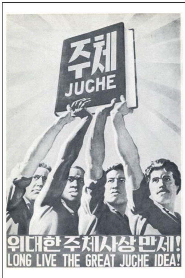
The simple binaries - capitalism/communism, rational/irrational, mature/juvenile, good/evil -

characterize almost all the post-communist reflections of erstwhile communist adherence, whether collectively or individually. The few exceptions, such as Christa Wolf who sought to recuperate the complexity of East German life under communist rule, are rare and castigated to boot. What then of one of the last redoubts of the former Second World of communism, North Korea? To be sure, the North Korean regime doesn't consider itself to be "communist" - in the dominant North Korean discourse, Soviet-style and Chinese communist models have both failed - but rather a democratic republic under the rule of the Labor Party and its ideology of juche (usually translated as "self-reliance"). Be that as it may, there is no doubt that as of 2016 the Labor Party under Kim Jong-un is in power and there isn't much popular reflection or remorse coming from North Korea save for the case of refugees who have fled the country.