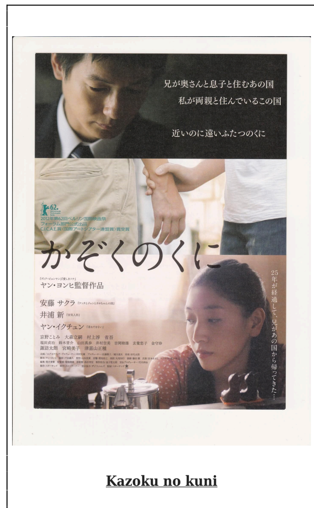
Kazoku no kuni

first-generation Zainichi in Osaka, and her brothers’ decision to emigrate to North Korea, and about Yang’s niece, a young daughter of one of the brothers who had emigrated to North Korea. Both accounts attempt to depict the full dimension of Zainichi and Zainichi-turned-North Korean lives, replete with humor and warmth often lacking in other accounts. Above all, without being blind to the larger context of Zainichi lives, the documentaries depict them as multidimensional human beings.