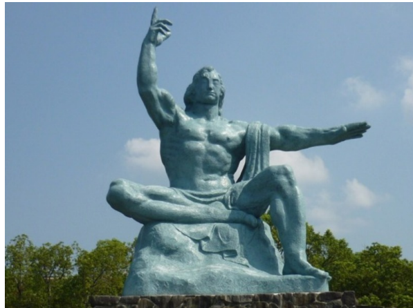
Nagasaki's Peace Memorial Statue photographed by the author

The specific motivation for preservation of the ruins varied from one group to another. Some city officials and business leaders saw a commercial opportunity in the remnants. Nagasaki was awarded first place in the "Top 100 Tourist Destinations of Japan," as presented by the Mainichi Shinbun in October 1950. One of the most popular tourist attractions of postwar Nagasaki was the site of the ruins of Urakami Cathedral. 18 The Nagasaki Tourism Office stated that removal of the ruins of the cathedral would result in the loss of important tourism revenue.