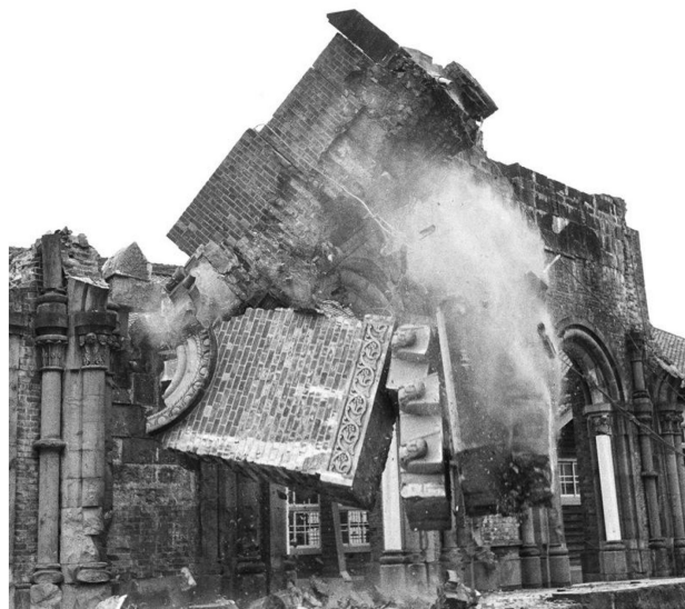
Dismantling of Remnants of the Cathedral

The construction of the new Urakami Cathedral was completed in October 1959. The question of how they eventually collected another $10,000 remains unknown. Three statues that survived the bombing were rehoused in front of the new cathedral, and a portion of the wall is located right beside the tower, making it the epicenter in the Nagasaki Peace Park. The Urakami Catholic leaders described the new cathedral as a symbol of the recovery and reconstruction of their community. However, Nagasaki perpetually lost its most powerful symbol of the dawn and suffering of the nuclear age.