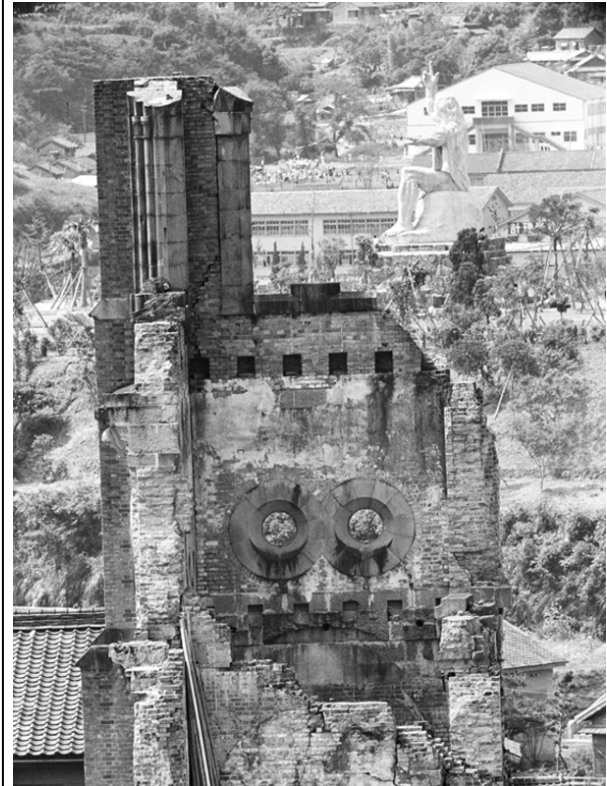
Remnants of Urakami Cathedral (front) and Peace Statue (back) in 1958

After his return from the United States in September 1956, Tagawa became reluctant to comply with the committee's recommendation for preservation of the ruins. By that time, a decade had already passed since the atomic bombing. Roads had been widened in the Urakami district; new houses had been built; and, the number of tourists had increased. With the reconstruction, other ruins left by the bombing had been dismantled. The ruins of the Urakami Cathedral were the only notable remaining vestige of the bombing in the city. Non-Catholic locals, especially hibakusha , were calling for their preservation as a material artefact to commemorate the tragedy. In contrast, very few Urakami Catholic hibakusha participated in the debate.