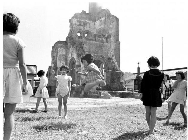
Remnants of the Southern Wall and statues of the saints of Urakami Cathedral