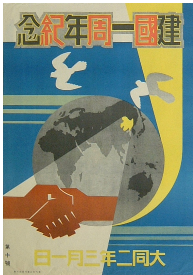
The "concord of nationalities"

The second legitimacy claim made by the puppet regime was that it represented the “concord of nationalities” ( minzoku kyowa ) a conceit that was supposed to represent two advances over older colonial ideas. Not only was the concord supposed to reject exploitation and the reproduction of difference between ruler and ruled, but it was also designed to counter the homogenization of differences that nationalism had produced and that had led to nearly insoluble conflicts. By allegedly granting different peoples or nationalities their rights and self-respect under a state structure, Manchukuo presented itself as a nation-state in the mode of the Soviet “union of nationalities”. Among others, Tominaga Tadashi, the author of Manshu no minzoku (Nationalities of Manchuria), wrote copiously about the early Soviet policy towards national self-determination. It was a policy that fulfilled the goals of federalism and protected minority rights, while at the same time it strengthened Soviet state and military power particularly with regards to separatism in the old Tsarist empire. Thus, nationalism ought not to be suppressed, but rather utilized positively for the goals of the state.(34)