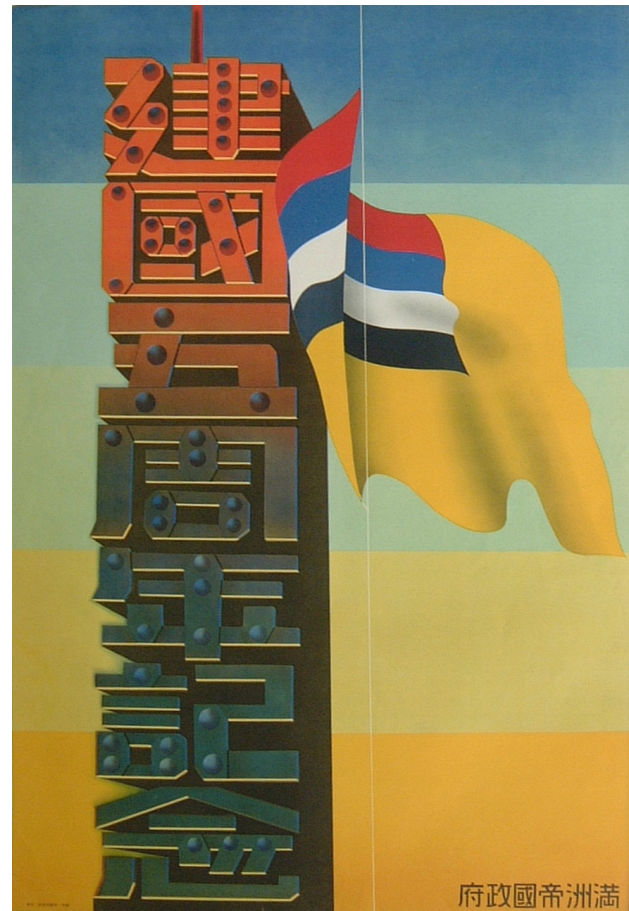
Manchukuo's industrial production