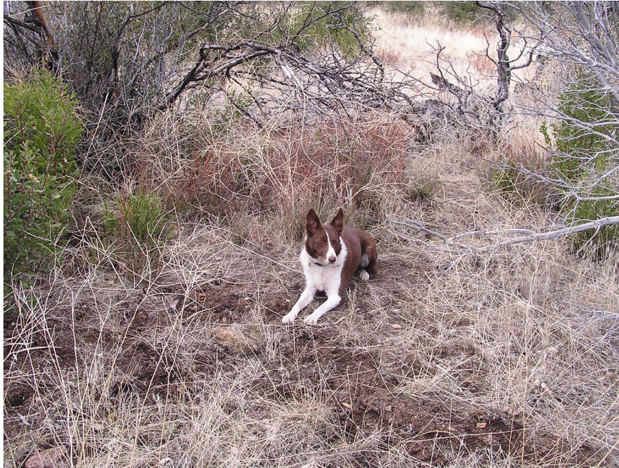
FIGURE 4. HHRD canine Rhea alerting at a cremation burial at Dripping Springs. The dog positions the alert so that her nose is near the location of strongest scent.

alerts were within or adjacent to the cremation burial area confirmed by Gamble (2017:82) using True’s archival map of the burial ground. Several of these locations had alerts by multiple dogs. Another four alerts were 60–80 m away from the identified burial area. At the request of the Native American monitor, no students were allowed to do field studies within the burial grounds, and no verification via excavation was undertaken. Given that canine alerts were concentrated in the cremation burial area, the results strongly indicate that HHRD dogs can identify ancient cremations (Figure 4).