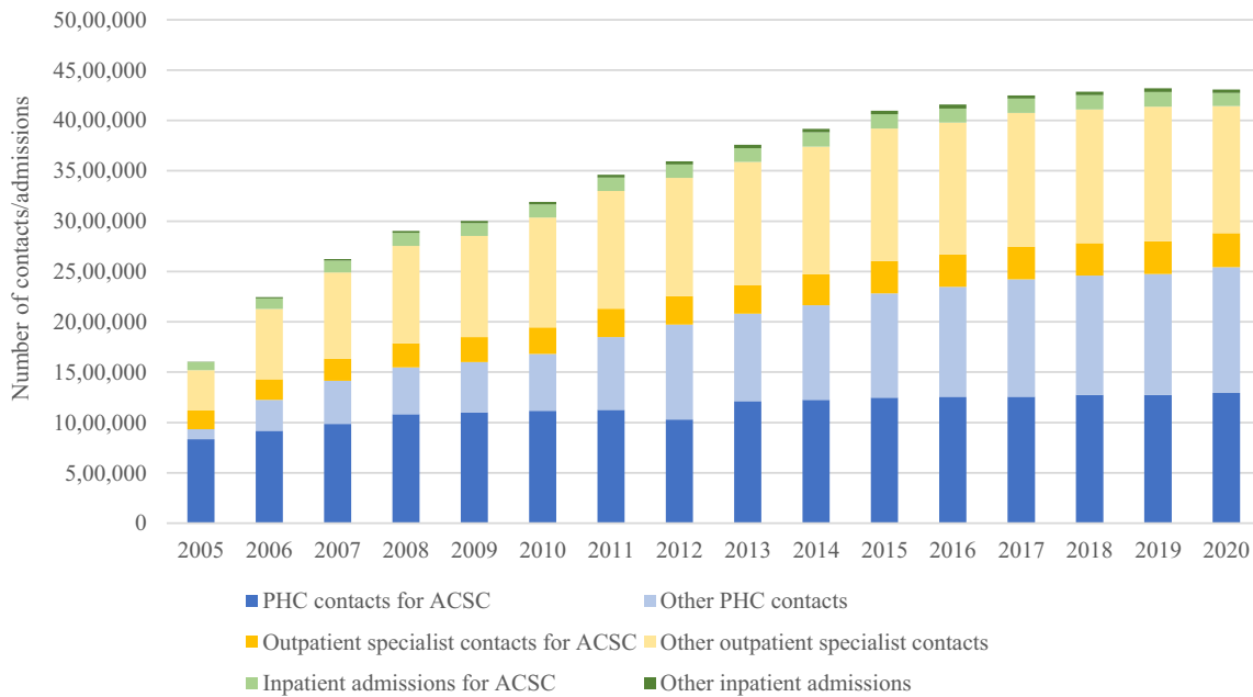
Figure 1. Service utilization among target population from 2005 to 2020.