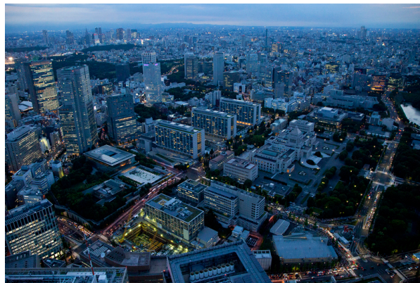
Noda Masaya (JVJA), Aerial Photograph of Demonstration 29 June 2012, Creative Commons Licence.

a helicopter in order to take an aerial photograph of one of the weekly demonstrations outside the Prime Minister's Residence ( Kantei-mae ). 20 By making this visual representation of the massed demonstrators available on the internet, the group challenged the mainstream media's failure to document the weekly demonstrations. 21 Cultural representation (in this case photographs) could not, here, be separated from activism. The aerial photograph of the crowds referenced the famous aerial photographs of the demonstrations around the Diet Building against the renewal of the US-Japan Security Treaty in 1960, thereby reconfiguring historical memory. The Kantei-mae demonstrations were thus placed in a longer history of demonstrations dating back to the 1960s.