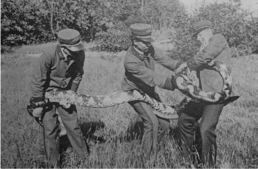
Figure 3. 'Handling a python', New York Zoological Society, postcard, 1906.