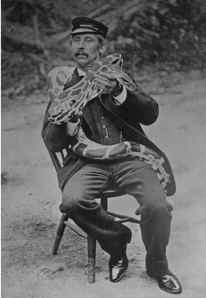
Figure 2. 'A London snake charmer', All about Animals (London: George Newnes Ltd, 1898), p. 138.

the Society's Reptile House is confined to cases in which such diet is a necessity, and in these cases all care is taken to avoid any unnecessary suffering'. 47 Taking this as an admission that live feeding did occur, Salt pushed to have it banned, or at least regulated, suggesting that an officer of the RSPCA be present during feeding times to ensure no gratuitous cruelty took place. 48