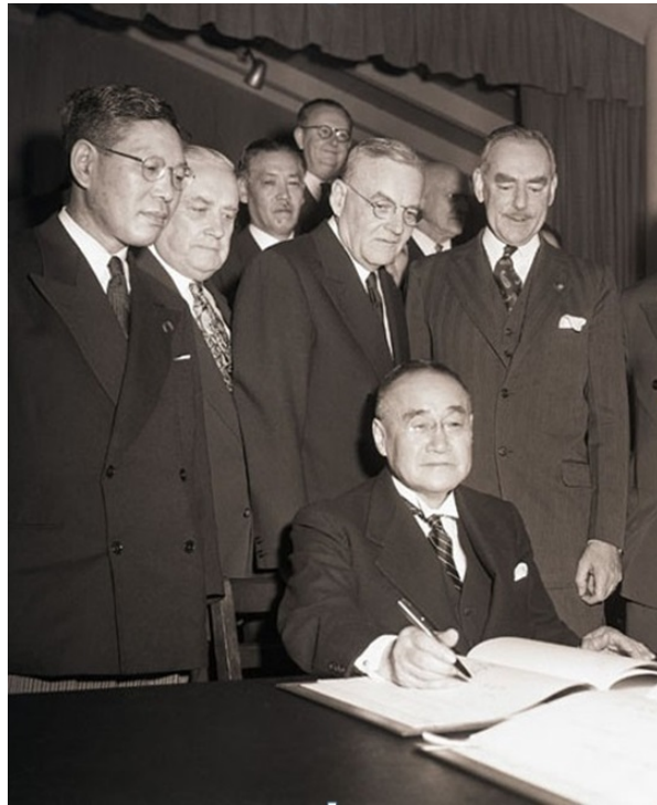
Japanese Prime Minister Yoshida Shigeru signs the San Francisco Treaty as John Foster Dulles (center) and Dean Acheson (right) look on.

The San Francisco Treaty together with the US-Japan Security Treaty signed later that same day served to establish the US camp for continuing the Korean War and defining Japan's position in it. We can call this the San Francisco System. In sum, the San Francisco System is an international state system that did not terminate a war but instead continued one: the Korean War. The enemy camp of the San Francisco System consisted of North Korea and the People's Republic of China, and, implicitly, the former Soviet Union. The vanguard of the US camp consisted of the US forces in Korea, South Korean troops, and Chinese Nationalist soldiers based in Taiwan. American headquarters and the main strategic and logistic bases were in Japan and Okinawa (the latter still fully under American occupation