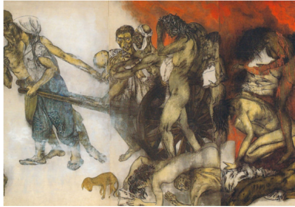
From Maruki Iri and Maruki Toshi, Hiroshima Panels

psychology that makes war possible... [and] will lead humankind to destruction." 50