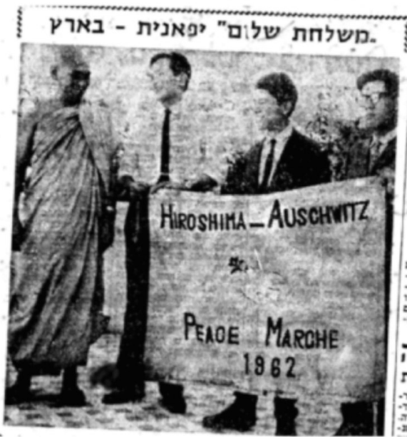
The Hiroshima-Auschwitz Peace Marche in Israel

As in Hiroshima and other places, in Poland as well there was a well-established victim-narrative. This was mostly about Polish victimization. The fact of Auschwitz-Birkenau being the "largest Jewish cemetery in the world," with over one million Jewish dead in its soil, was completely marginalized. 66 As Irwin Zarecka pointed out, Auschwitz for Poles "was not a symbol of Jewish suffering but a symbol of man's inhumanity to man and a place of Polish tragedy." 67 In a similar way to Hiroshima, the Auschwitz museum sought to make it to a place of international tragedy but with an emphasis on a very specific Polish victimization. As in Hiroshima, which long discriminated against the Korean dead, Auschwitz as well was used as a tool for marginalization of the dead Jews. In Auschwitz, however, the Jews were an absolute majority of victims with about a million dead, in comparison to the horrendous but much smaller number of 75,000 Polish victims. 68 In the immediate postwar and up to the nineties, Poles would speak of six million