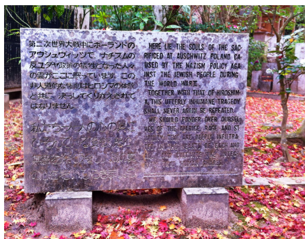
The Hiroshima Auschwitz Memorial in Hiroshima where the Auschwitz remains