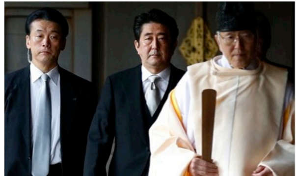
Abe (center) visiting Yasukuni Shrine

Abe's visit to the Yasukuni Shrine in December 2013 was only the climax of his career as a historical revisionist. It has been his declared objective to "overcome the postwar regime" and rectify the "distorted image" of Japan's wartime past rooted in Japanese society. The image that he is referring to, one widely shared not only by Japan's Asian neighbors but also by its patron and ally the United States, is that of Japan as an aggressor nation in the Asia-Pacific War (1931-45). For Abe, the war was rather one fought for the defense of Japan against the Western colonial powers and for the liberation of East Asia.