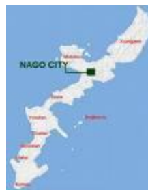
Nago City map

The special financial zone designation, the only one of its kind in Japan, includes a 35% reduction of corporate taxes, low-rent office space, an 80% subsidy for communication expenses, and a 30% subsidy for hiring young workers. Given that wages in Okinawa tend to be about 40% lower than the mainland, the 30% subsidy means that firms relocating to the Nago City financial center can achieve a 70% reduction in labor costs.[24]