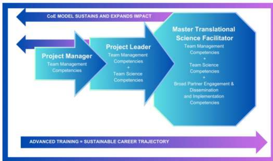
Figure 2. Career Pathway for the Project Management Innovation Center of Excellence (PROMICE). This figure shows how team members in the role of project manager can transition to the role of Project Leader 45 by acquiring competencies in team science. With further training, they can transition to the role of Master Translational Science Facilitator. In addition to demonstrating strong skills in project management and team science competencies, Master Translational Science Facilitators are also skilled in Dissemination and Implementation competencies and Broad Research Partnership Engagement competencies. The Center of Excellence (CoE) model utilized by PROMICE allows broader impact using a train the trainer model in which Project Leaders and Master Translational Science Facilitators share what they have learned with those early in the career trajectory. 55