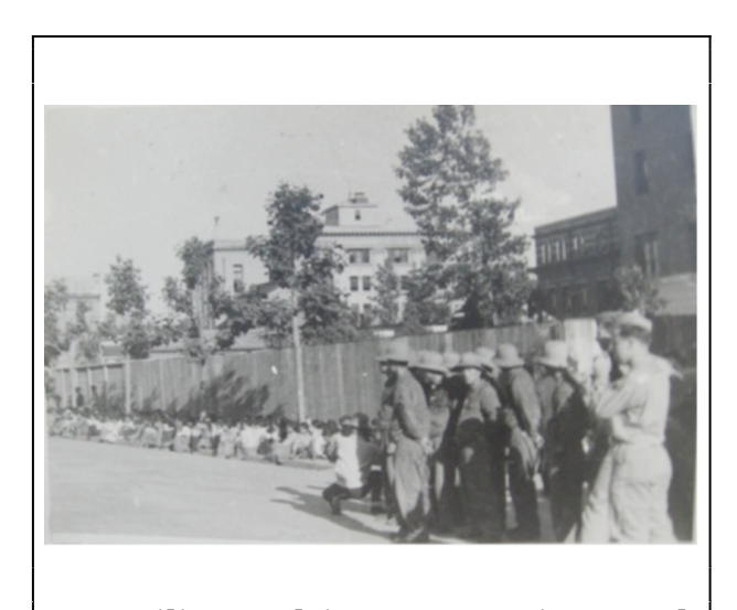
U.S. military advisors overseeing South Korean police during the suppression of the Taegu Uprising, October 1946.

October 1946. Despite ongoing debate over how deeply the Military Government was involved in quelling outbreaks of civil violence in Korea since the 1940s, there is no question but that its influence on Korean affairs was substantial.