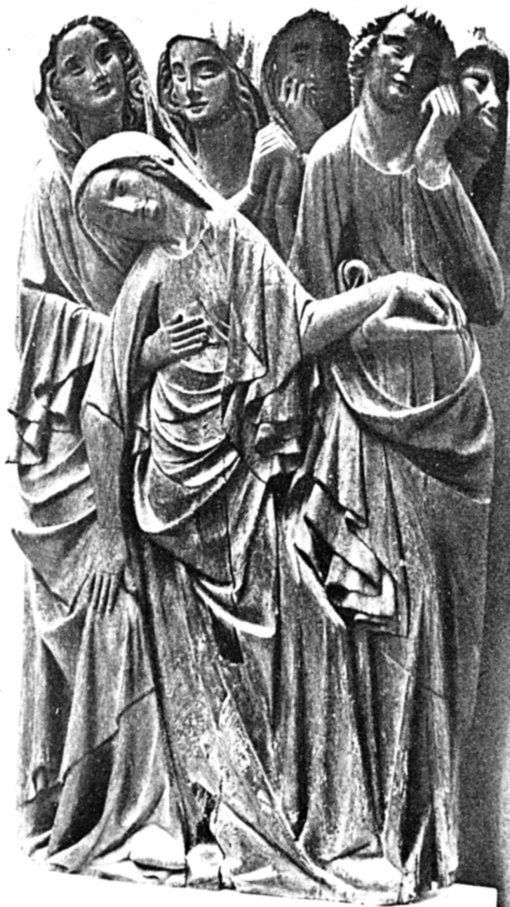
THE SWOONING OF THE VIRGIN