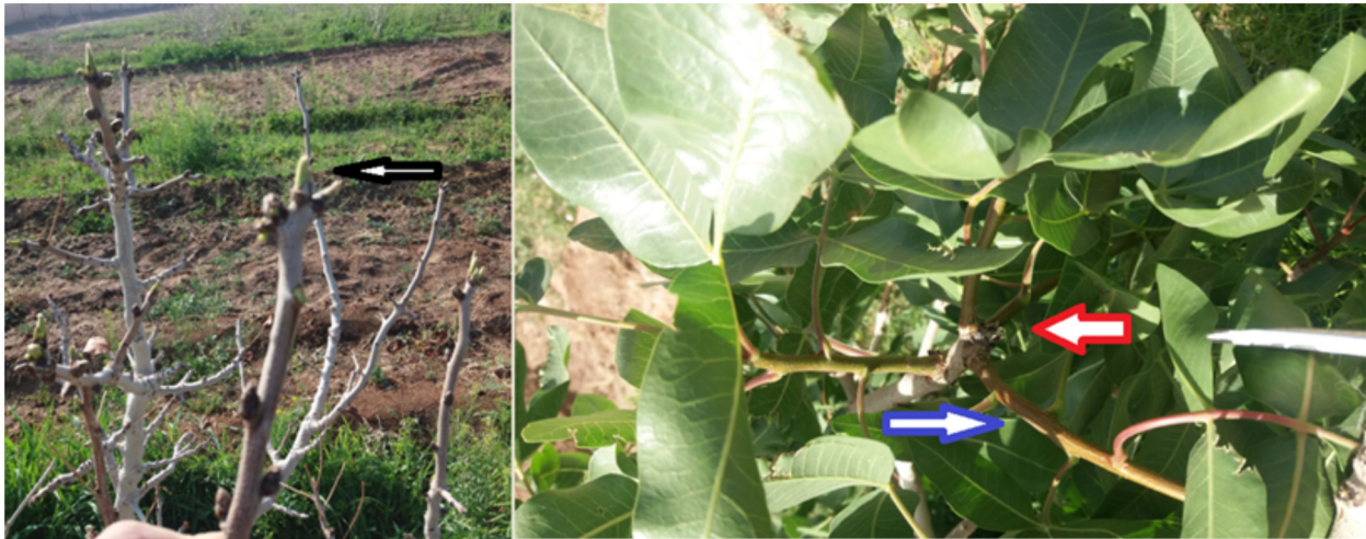
Figure 1. Comparison of control (left) with terminal bud growing (black line) and 'Apatiye' cultivar (right) with abort terminal bud; dead terminal bud (red line) and shoots grown from lateral buds (blue line).

number of shoots and their length determine the yield of the trees. Pistachio trees have few lateral shoots because of the low number of vegetative lateral buds and strong apical dominance. Removal of terminal buds can reduce apical dominance and stimulate lateral bud formation. In this study, 'Apatiye' cultivar produced had more lateral shoot through the death of the terminal buds. This trait has already been reported in some fruit and forest trees (Costes et al. , 2015). In conclusion, it can be said that 'Apatiye' cultivar has a valuable potential for breeding pistachio cultivars with low alternate bearing and suitable for manual harvesting.