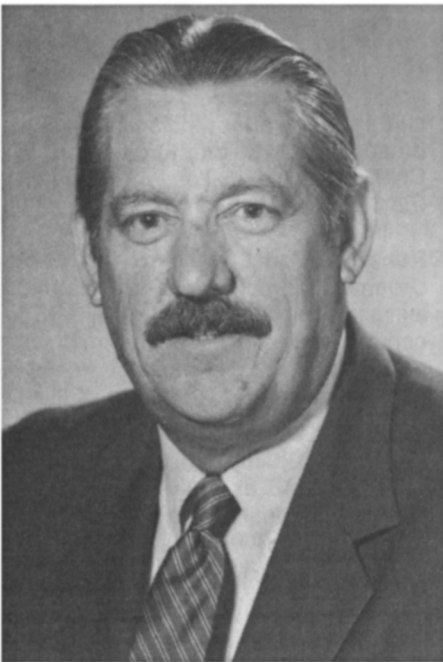
Fred R. Harris has been appointed director of the Institute for Public Policy at the University of New Mexico.