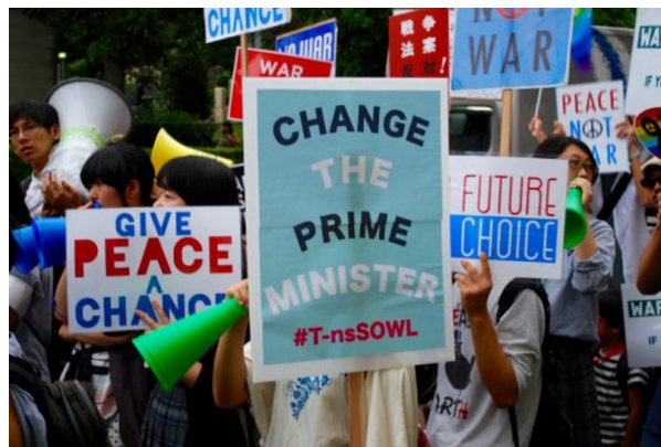
Protest Posters at the SEALDs demonstration, August 23, 2015, Shibuya

demonstrations are more tightly controlled and disciplined. They are not singing and dancing in cosplay clothes but have reverted to a call and response style of demos that date back to before the emergence of sound demos in 2004, punctuated by speeches that are designed to unify their participants in auditory and emotional rhythm. SEALDs has established its own design subgroup of core members to shape their visual images online and through the placards at the demos, even to choreograph the demo itself (their posters (see Fig 7)--even Youtube is attractive and professional). They control who can speak at the demonstrations so their message stays on point, and they invite a range of high profile politicians, scholars, and mainstream media to their events to lend legitimacy to their movement without compromising their independence. They have worked hard to keep good relationships with the police, who, while charged with keeping order at their demonstrations, are often funneling everyone who comes out the exit of Kasumigaseki Station to the right places.