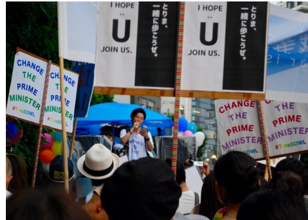
SEALDs demonstration, Shibuya, August 23, 2015

Another SEALDs member also stressed the need to make their movement appealing to “regular” students. She argues that their movement has to be attractive if they hope to persuade college students to care about politics and social issues. She said: