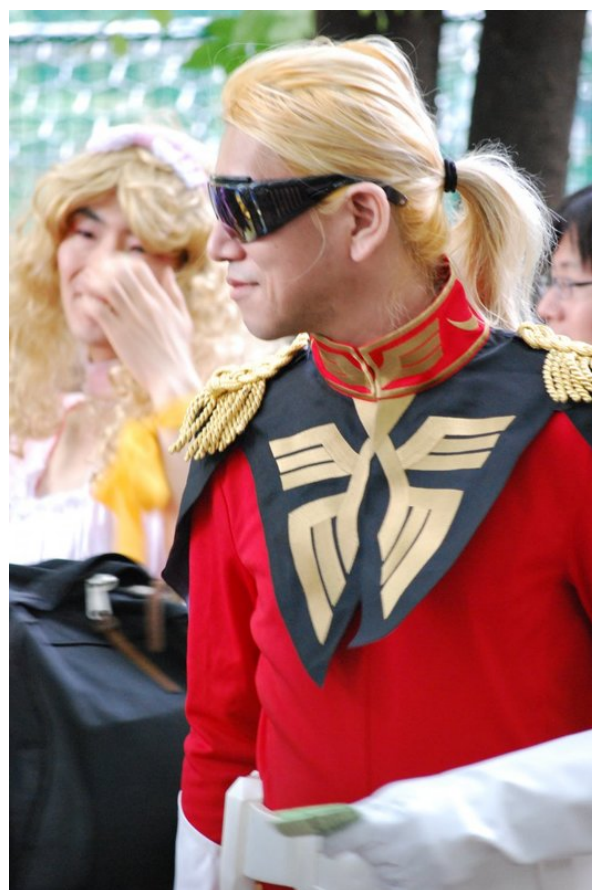
Protestors dressed in cosplay outfits are part of the characteristics of freeter protests. Freedom and Existence May Day protest. May 4, 2009. Miyashita Park, Tokyo, Japan.

In contrast to the freeter movement, SEALDs' main grievance is more circumscribed. Indeed, their focus on stopping current security legislation has been criticized by some as being too limited. Yet their framing of the issues—"No More War" or "Stop Abe" have narrowed these issues down into powerfully felt and clearly articulated issues that direct action can be identified and taken to address. SEALDs may have a limited focus on stopping current security legislation, but the simplicity of its message appears to be effective. On the other hand, the resistance by Amateur's Riot, and the General Freeter Union to adopting a unifying platform beyond a loosely defined identification with being a "precariat" for their movements has led to criticism that they lack coherence and focus, making it that much harder to communicate their message. Short of a wholesale redistribution of wealth or revamping of labor regulation—indeed, calling into question the foundations of Japanese postwar capitalism—it is even now somewhat difficult to identify a cause, event or any action that would address the grievance behind the freeter movements. It is not perhaps surprising that it was more difficult for the freeter movements to convince potential supporters of the immanent dangers of participating in irregular employment. The challenge to sufficiently understand, explain, and offer concrete alternatives to neoliberalism also exacerbates the movement's dilemma in mobilizing new members.