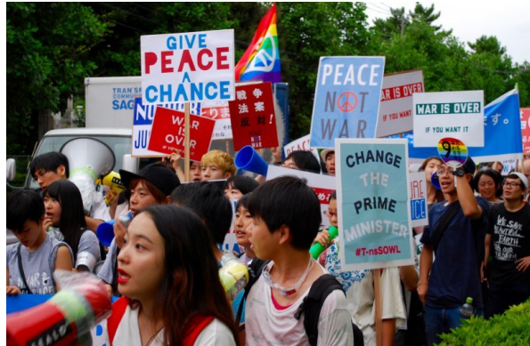
SEALDs demonstration, August 23, 2015 2

See footnote 1 in regards to the article title.