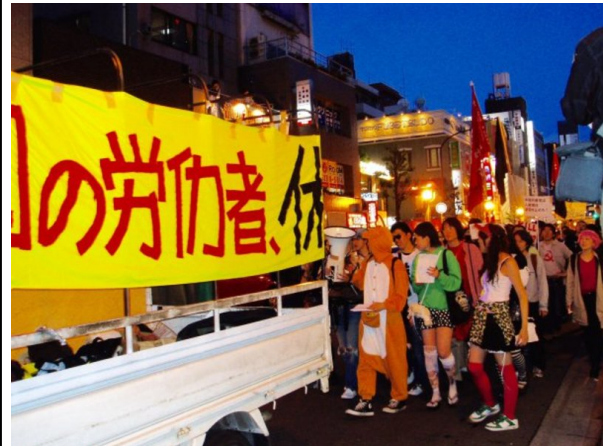
Freeters protest at the “May Day 2008, Freedom and Existence: Precariats Multiply and Connect” ( jīyū to seizon no me-de-2008: purekaria-to wa zōsyoku/renketsu ), May 3, 2008. Shinjuku, Tokyo, Japan.