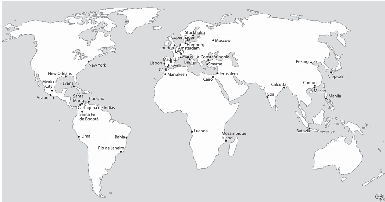
Figure 2.2 Some of the world's principal commercial entrepôts and urban consumer markets for cinchona in the late 1700s and early 1800s.