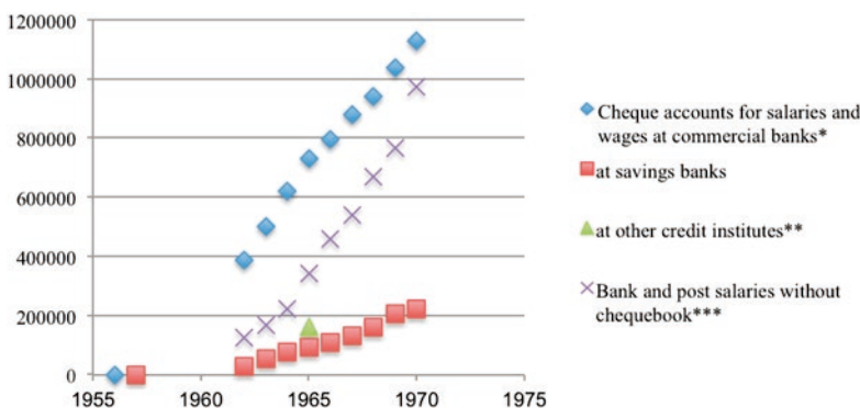
Figure 1 Number of checking accounts for salaries and wages

In the decade between 1957 and 1966, more than a million new checking accounts were opened, with 800,000 of them at commercial banks (Figure 1). This is a significant number, taking into account the total population of 7.6 million consisting of around 2.8 million households and a total labor force of about 3.6 million (including the agricultural sector, where bank wages were rare). In addition to checking account salaries, direct-to-account salaries and wages without