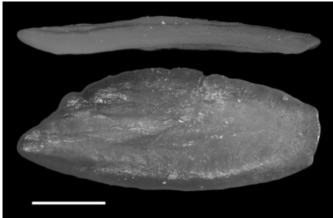
Figure 4. Right sagittal otolith of A. arigato (ASIZP-0082289). Top: ventral view; bottom: proximal view. Scale bar = 1 mm.

Dorsal-fin origin right behind the operculum; pectoral fin short; pelvic fin absent. First dorsal-fin base slightly shorter than second dorsal-fin base; with first dorsal-fin base 37.7% SL and second dorsal fin base 45.8% SL; prepectoral length 20.8% SL.