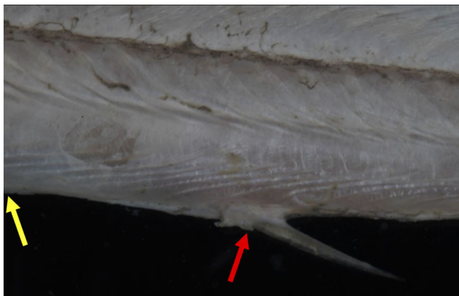
Figure 3. Details of the anal spine of A. arigato (ASIZP-0082289). The yellow arrow indicates the position of the anus; the red arrow indicates the rudimental first anal spine.