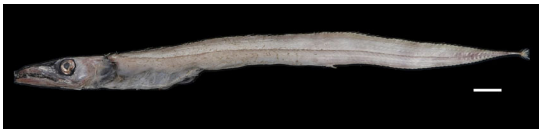
Figure 1. Whole specimen of Aphanopus arigato (ASIZP-0082289) caught around Dongsha Atolls, South China Sea. Scale bar = 20 mm.