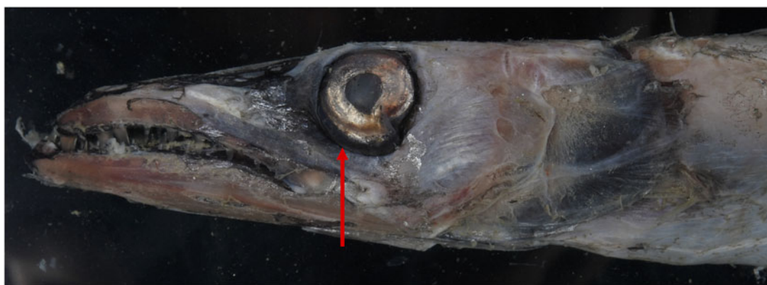
Figure 2. Details of the head profile, snout, and teeth of A. arigato (ASIZP-0082289). The red arrow indicates the posterior end of the upper jaw.

Head large, head length (HL) 18.4% SL; eye large and slightly oval, eye diameter is 17.6% of HL, situated laterally; interorbital width 13.3% HL. Snout long and large; snout length 7.8% SL; posterior end of upper jaw reaches the middle of the eye; lower jaw projected anteriorly to upper jaw (Figure 2). Teeth sharp and strong, triangular shaped, in a uniserial arrangement on upper and lower jaws (Figure 2). Mouth large, gently curved; maxillary length 50% of HL.