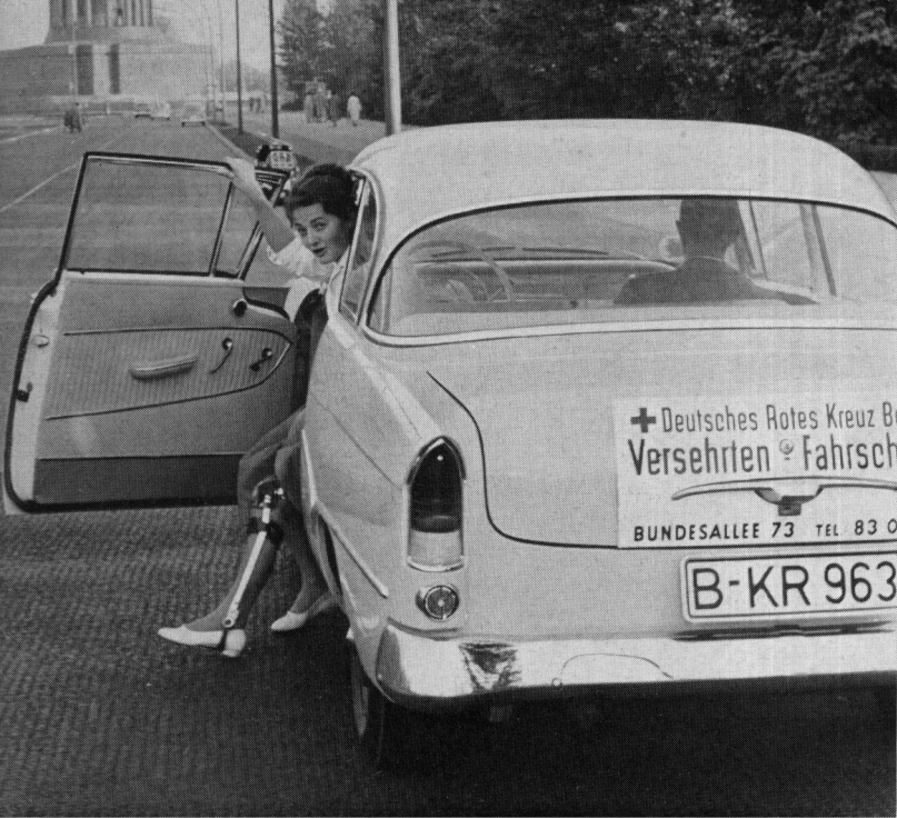
One of the cars of the driving-school for the disabled...