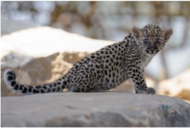
Female Arabian leopard Panthera pardus nimr cub born at the Wild Mammal Breeding Centre, Muscat, Oman on 15 February 2023.

in 2022 by a female from the Breeding Centre for Endangered Arabian Wildlife in Sharjah, United Arab Emirates. On 15 February 2023 she gave birth to the centre's first cub in 26 years. The female cub provides new hope for the survival of this Critically Endangered leopard in Oman and across Arabia, as both the wild and captive populations of this subspecies are very small. In addition, as the sire of the cub is a wild-caught Arabian leopard, she may contain some valuable genetic material that can be used to increase the genetic diversity of the captive Arabian leopard population across the region.