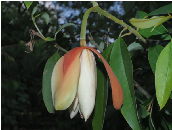
Manglietia ventii blooming in Kunming Botanical Garden.

and is endemic to Yunnan, China. It was categorized as Endangered on the IUCN Red List in 2012 and the China Red List of Biodiversity–Higher Plants in 2020, and listed as a second-ranked National Key Protected Wild Plant of China in 1999 and 2021, and by the Yunnan provincial government as a Plant Species with Extremely Small Populations in 2009. On 6 September 2023, in Kunming Botanical Garden in Yunnan, the ex situ population of 28 individuals, planted in 2015, bloomed for the first time.