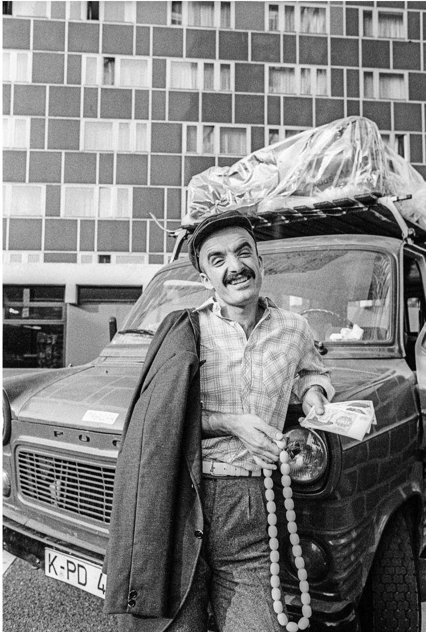
FIGURE 2.1 A quintessential portrayal of an Almanca , whom Turks in the home country denigrated as superfluous spenders, flaunting his Deutschmarks and posing proudly in front of his loaded-up car, 1984.