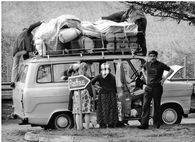
FIGURE 2.5 Turkish vacationers at a rest stop on the E-5 in Austria, ca. 1970. Their car, an iconic Ford Transit, is loaded to the brim with consumer goods, including a rooftop luggage rack.

workers deliberately opted for cars that could hold not only large quantities of luggage but also large families. The Ford Transit, a sturdy and spacious minibus first produced in 1965, became such an iconic symbol of the guest worker program that the German city of Bremen erected a statue of it in 2017 (Figure 2.5). 97