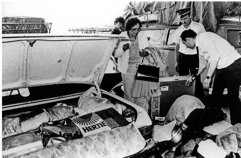
FIGURE 2.3 Border guards inspect guest workers' cars at the Bulgarian-Turkish border at Kapıkule, mid-1970s. The woman's trunk is stuffed full of consumer goods, including a bag from the West German department store Hertie.

extortion, and guest workers reported having to wait in hours-long lines of cars just to cross the border. 68 Murad rejoiced that his family was able to skip the lines because his uncle was the wealthy mayor of a local community. 69