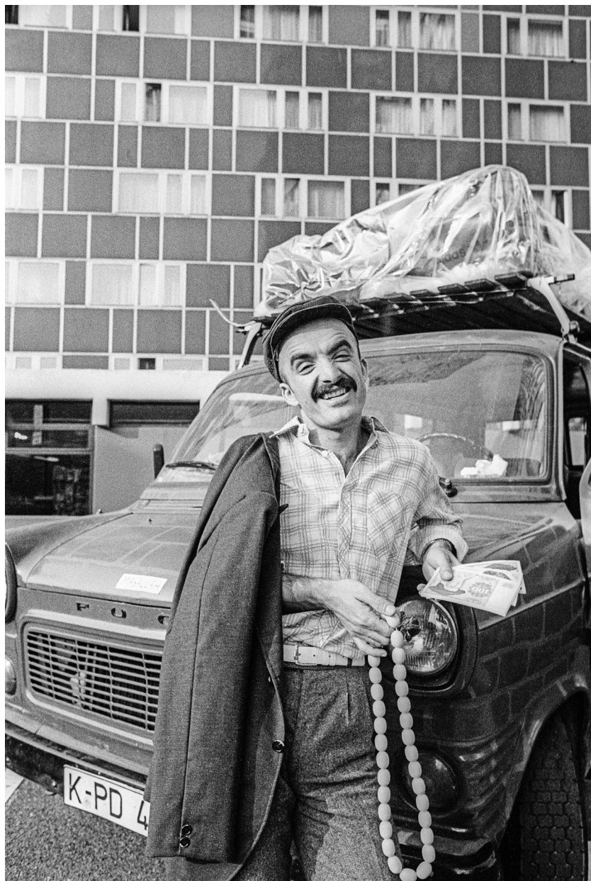
FIGURE 2.1 A quintessential portrayal of an Almancı , whom Turks in the home country denigrated as superfluous spenders, flaunting his Deutschmarks and posing proudly in front of his loaded-up car, 1984.