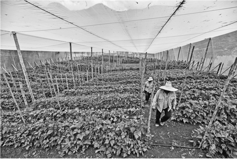
Figure 8.2 The bean collections established earlier in CIAT's history continue. Today, maintaining CIAT's collections of bean germplasm involves the multiplications of seeds in screenhouses in Colombia's Central Cordillera, 2017.

In 1978, CIAT appointed a permanent resident scientist to Central America to improve coordination with national bean programs. 45 This step set the foundation of PROFRIJOL. During its first two years, the project received funding from the United Nations Development Programme (UNDP); afterwards, in the 1980s, the Swiss Agency for Development and Cooperation (SDC) provided funds. 46