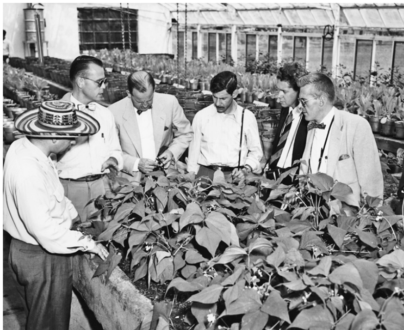
Figure 8.1 Beans featured among the objects of research and breeding at the Rockefeller Foundation's agricultural program in Colombia. Here a small group considers beans growing in the greenhouse, ca. 1954.

Between its creation and the 1980s, CIAT developed six broad programs encompassing plant-breeding research and training. The rice program, launched in 1967, took advantage of an alliance with IRRI in the Philippines and ICA in Colombia. 8 On the one hand, cooperation with IRRI turned CIAT into a “genetic bridge,” allowing the transcontinental exchange of rice varieties and the introduction of the high-yielding variety IR8 germplasm to Latin America. Following IRRI's experience, the program developed high-yield varieties suited for irrigated rice, and created an intensive agrochemical package for pest control and plant disease. 9 On the other hand, the association with ICA enabled experimentation and field testing of Asian rice varieties in Colombia and