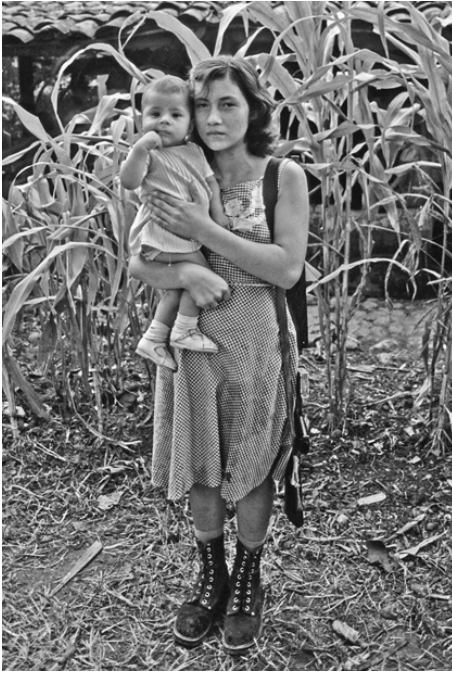
Figure 8.4 The scorched-earth ferocity of Central America's civil wars affected rural peoples and food production. In this image from 1983, a young woman with the insurgency poses with child and assault rifle in front of maize in Guazapa, El Salvador, a region targeted by the Salvadoran army.

from the repressive army forces. Farm fields became battlegrounds, displacing hundreds of thousands of peasants. According to the United Nations Refugee Agency, conflict expelled roughly 20 percent of El Salvador's population, while other estimates indicate that 14 percent of the population in Guatemala and Nicaragua fled from their countries. 71 Some studies estimate that a total of around 2 million