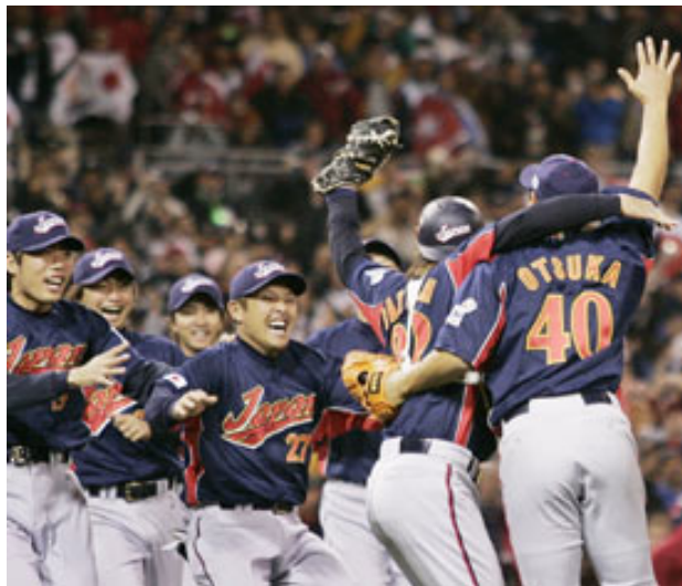
The Japanese team after winning WBC 2006

season-hits record, while spurring an influx of tourists from Japan that has brought millions of dollars into the Northwest area economy. Matsui has become a popular, reliable fixture in the New York Yankees outfield, while Tadahito Iguchi played such an important role on the 2005 World Champion Chicago White Sox squad that his manager Ozzie Guillen called him the real MVP of the team. The subsequent emergence of an enormous new market for Mariner, Yankee and White Sox telecasts in Japan has also helped. At the end of the 2003 season, Major League Baseball (MLB) signed a record $275-million TV contract with the giant Japanese advertising firm Dentsu, and then sent the Yankees and the Tampa Devil Rays to play an opening-day game in Tokyo in 2004. Moreover, the MLB and the Major League Baseball Players Association (MLBPA) enthusiastically promoted the establishment of the World Baseball Classic (WBC), a quadrennial tournament that debuted in March 2006, featuring national teams from 16 countries—with American organizers going to extraordinary lengths to coax an initially reluctant Japan to join in. All in all, that represents quite a transformation.