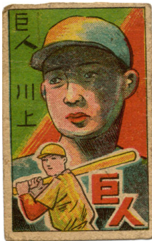
Tetsuharu Kawakami baseball card

samurai'—and rather more like definitions of effort familiar to athletes in the United States and elsewhere. [20]