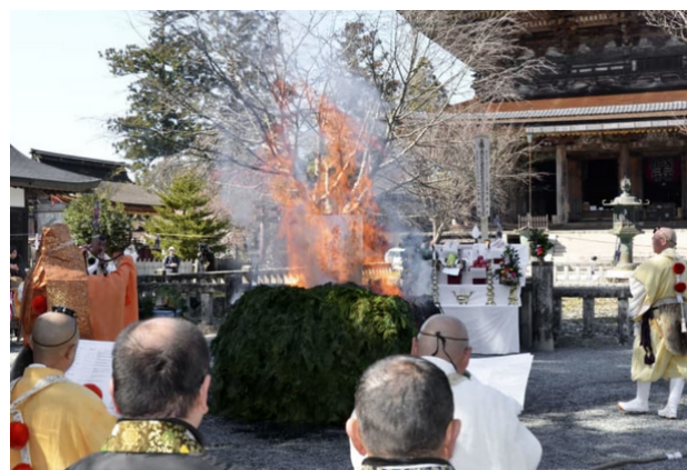
Shugendō ascetics gather on 6 March 2020 at the daikitōe (great prayer assembly) at the temple Kinpusenji to ritually expunge COVID-19.

challenging bodily austerities, secret teachings and initiations, and other distinctive elements for worship at remote mountain sites. Major Shugendō affiliate temples have been responding to the pandemic in ancient ways. For example, the Shingon temple Daigoji in Kyoto on April 15 dedicated the centerpiece of its three-week-long sakurae (cherry blossom assembly), a goma kuyō (fire pūjā ) and performance of kyōgen (comic ritual plays), to eliminating the disease. 31 Another goma kuyō was performed at noon daily at the Shugendō-affiliate temple Kinpusenji in Nara's Yoshino district to drive away the virus. On March 6, fifty shugenja (Shugendō renunciants) gathered at a daikitōe , a "great prayer assembly," a goma kuyō put on jointly by Kinpusenji and the temple Ōminesanji. This was the first ritual collaboration between these sites since they were separated in the Meiji era (1868-1912). 32 The event was broadcast over social media and received hundreds of supportive messages. 33