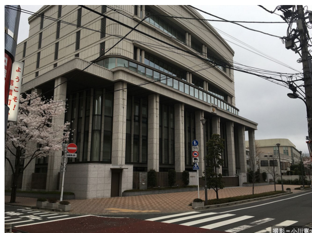
Streets around Soka Gakkai’s Hall of the Great Vow of Kōsen Rufu remain empty after it closes its headquarters in Shinanomachi, Tokyo.