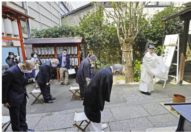
Rites at the Shinto shrine Matatabisha in Kyoto to quell COVID-19.

across Japan. On April 8, Shinto priests at Matatabisha, a branch shrine of the famed Yasaka Shrine in Kyoto, performed a Gion goryōe , or “assembly at Gion for angry spirits,” specifically aimed at quelling malevolent powers for the quick elimination of coronavirus. 27