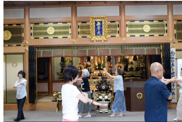
Members of the Rengekai (Lotus Association), the monthly women's meeting at the Jōdo Shinshū temple Tenshinji in Chiba prefecture, practice the obon dance for the summer festival in 2015. Countless local-level gatherings like this are on hold during the coronavirus crisis.

Religion in Japan, as it is elsewhere, tends to be intensely social. For the devout, life consists of frequent in-person meetings. In religious gatherings of all types, believers depend on inspiration from one another. Their sense of self relies on group activities, and the survival of religious groups relies on solidarity their participants cultivate through interpersonal bonds. Prolonged social distancing may exact a toll on Japan's religions. It remains to be seen how isolation will exacerbate differences between internal constituencies and how it will affect parishioners' desire to return to regular participation.