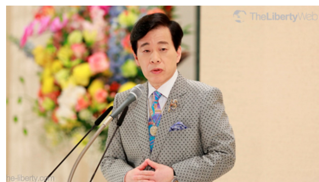
Happy Science founder Ōkawa Ryūhō addresses followers in Sendai on 14 March 2020.

Cantare, along with other beings, Ōkawa highlighted messages he received about coronavirus as an existential threat to Japan. 19 Happy Science caught media attention for defiantly gathering large numbers of members just as other New Religions closed down; Ōkawa addressed approximately 1300 followers and guests in Kagawa prefecture on February 22 and 1200 in Miyagi prefecture on March 14. In his speeches and in the religion's publications, the spiritual leader advanced Happy Science's rightwing Japanese political agenda as it advertised his signature ritual practice as the most effective means of eliminating the disease. 20 "This infection is made in China," Ōkawa announced. "To combat a godless communist dictatorship that is spreading sorcery across the world to oppress human rights and exert its hegemony, I am thinking of a divine protection. Services at our branches and Viharas ( shōja ) focus primarily on watching and listening to videos of dharma talks and praying. We are not curtailing these services, but we are taking sufficient precautions by using alcohol-based disinfectant and monitoring health conditions." 21